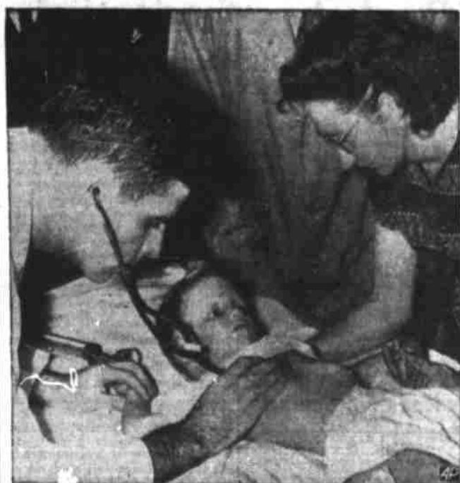
Child In Coma Sped To Hospital

AFTER THE FIRE IS TOO LATE Let us see that you have PROPER fire insurance protection NOW. Come in... or just call. H. B. Reagan Agency EASY PARKING 207 W. 4th Dial 4-7251