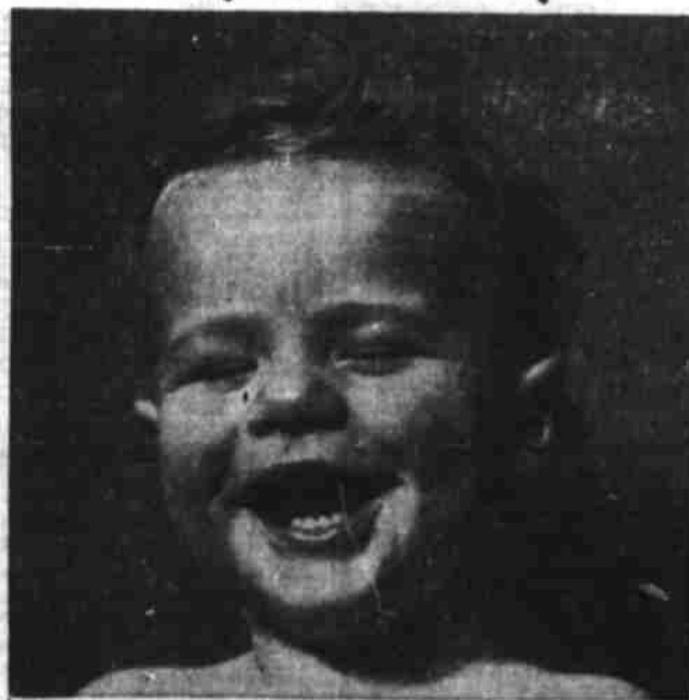
"Guess what! The receiver was off the hook"

"Big joke, I thought! That is, 'til I found out I lost an important call because of it. Not only that, I've learned that the receiver off the hook on my phone puts every telephone on my party line out of commission. Sure taught me it's worth an extra second or so to replace the receiver correctly after I finish a call." SOUTHWESTERN BELL . . . A TEAM OF 27,600 TEXAS TELEPHONE PEOPLE . . . AT YOUR SERVICE.