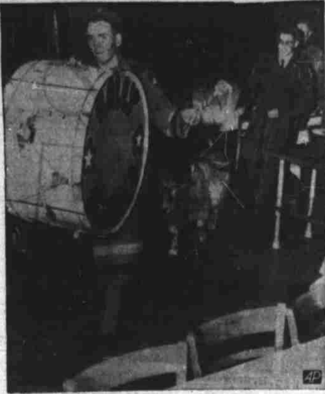
Army Gets Navy's Goat

Led by a booming bass drum, an impromptu parade of West Point cadets and GIs stationed at West Point military academy escorts the Navy Academy's mascot, Billy XII, through Washington Hall at evening mess. The goat was kidnapped at Annapolis and brought to the Point. It was returned last night to the Naval Academy, apparently with Pentagon pressure on. (AP Wirephoto).