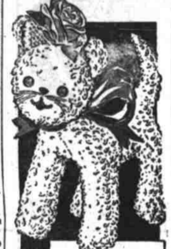
123 Crocheted Kitten