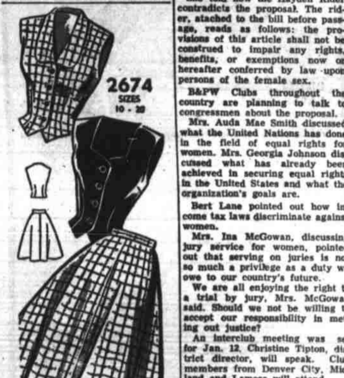
2674 SEES 10 - 20

Members of the B&PW prepared to wage war on the Hayden Rider Amendment when they met Tuesday night at the Settles Hotel.