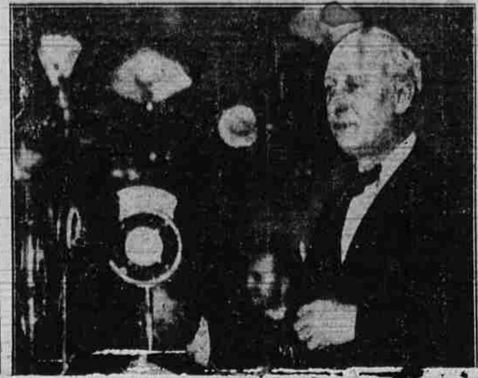
This Associated Press telephoto shows Alfred E. Smith, democratic presidential candidate in 1928, as he spoke in Newark, N. J., in behalf of the democratic ticket.