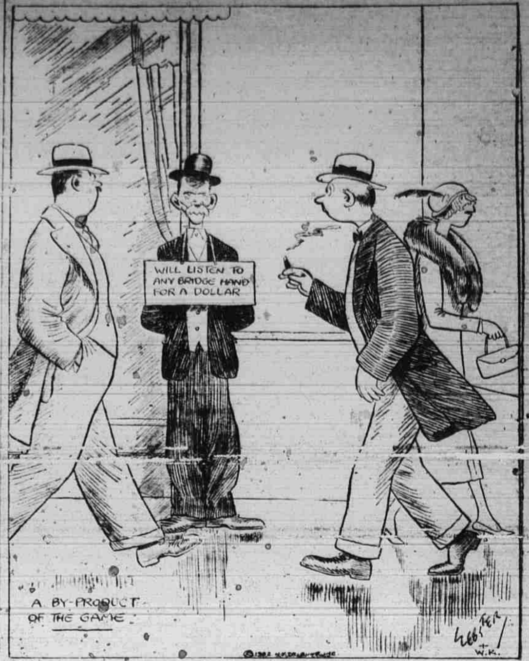
A BY-PRODUCT OF THE GAME