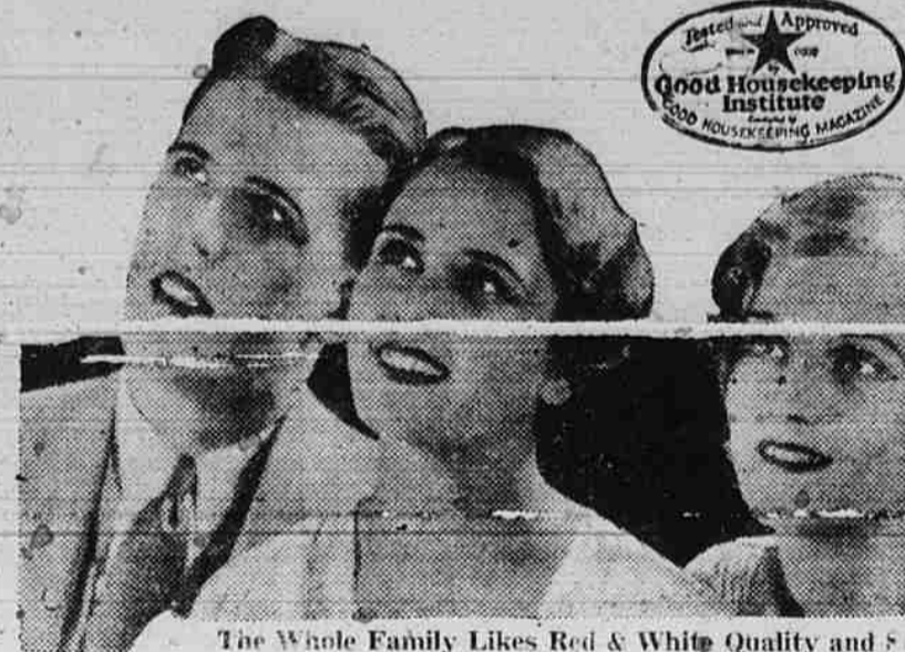
The Whole Family Likes Red & White Quality and Service.