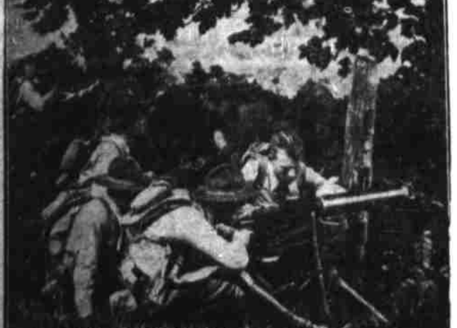
equipment, West Point cadets went forth Here a machine gun unit is putting the