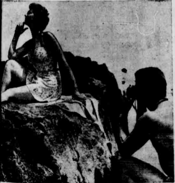
Something for your album—Choose a good background, pose at an angle if you

3. When it comes to your figure, the rule in posing is worth remembering: Hips and shoulders should be at an angle to the camera—they'll look slimmer. Legs should be trimmer and more graceful if they're kept close together and slightly bent. Legs should be at an angle to the camera, too. Girls can take a graceful pose by placing one leg a little in front of the other, and putting a heel on the hip. A seat cushion sometimes helps con-