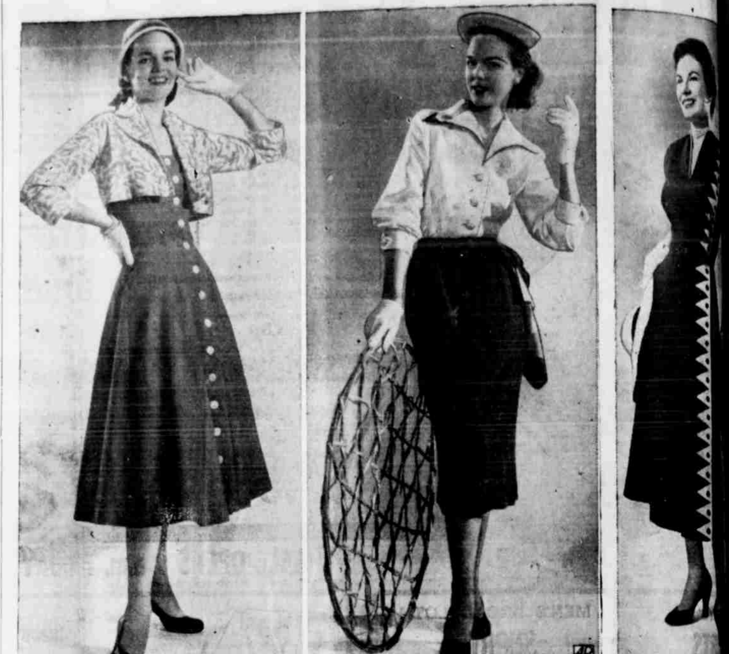
YOUNG FAVORITES—Some like 'em slim, some like 'em flared. Opinion is divided among the young crowd on the subject of skirt widths, so St. Louis designers, who specialize in youthful styles, are making them both ways this spring. Typical styles above are (l. to r.): the princess line in a dress of rayon linen with embroidered bolero; shirt-waist dress with a two-piece look and trim, slim lines, in black rayon lines, saw-tooth band, all spring fashions, design by Louis.