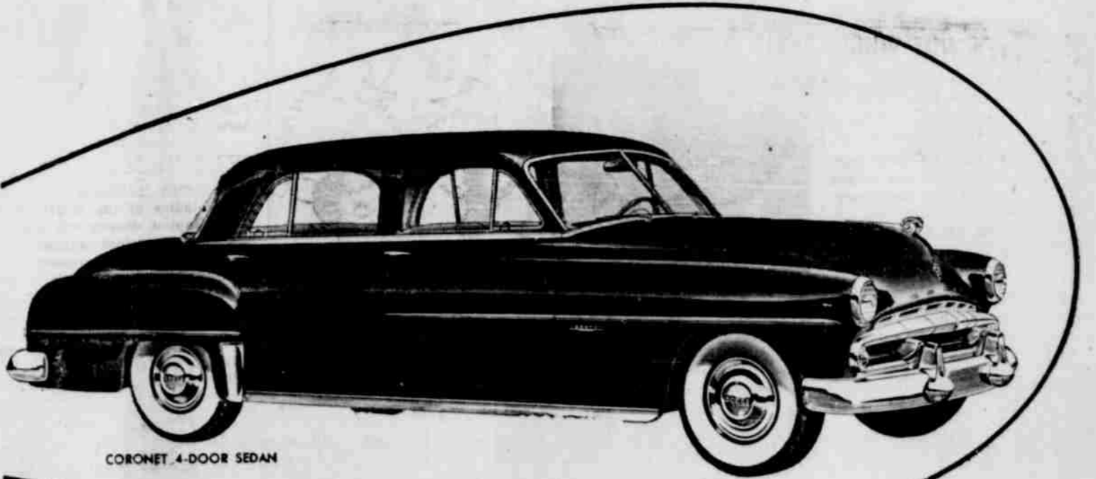
CORONET 4-DOOR SEDAN

See HOW COMFORTABLE You are in the '52 Dodge!