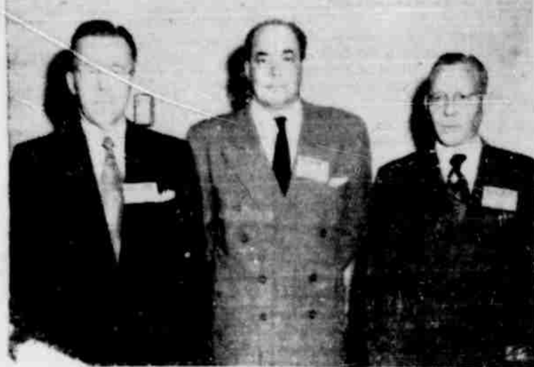
DAIRY PRODUCTS INSTITUTE HEADS—The Dairy Products Institute of Texas elected new officers during the organization's 44th annual convention in Fort Worth. The men who will