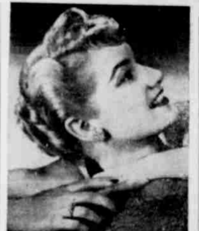
BEST TRESSED—A smooth brushed effect of soft waves. Designed by M. Louis.

The rumor is that Mom's pet poodle will play a big part in the Easter parade. Besides the fact that Mom and poodle will have matching hairdos, predictions are that they might even wear matching chapeaux.