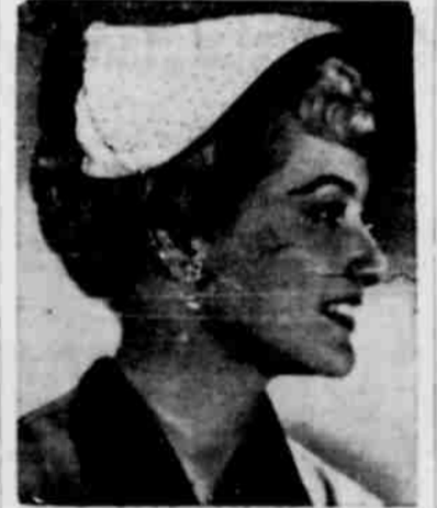
A HIT WITH A HAT—Wear your chapeau on the level with new spring hairdos.