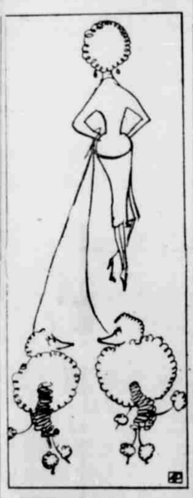
EASTER PARADE—Will poodle and mistress wear matching hairdos?