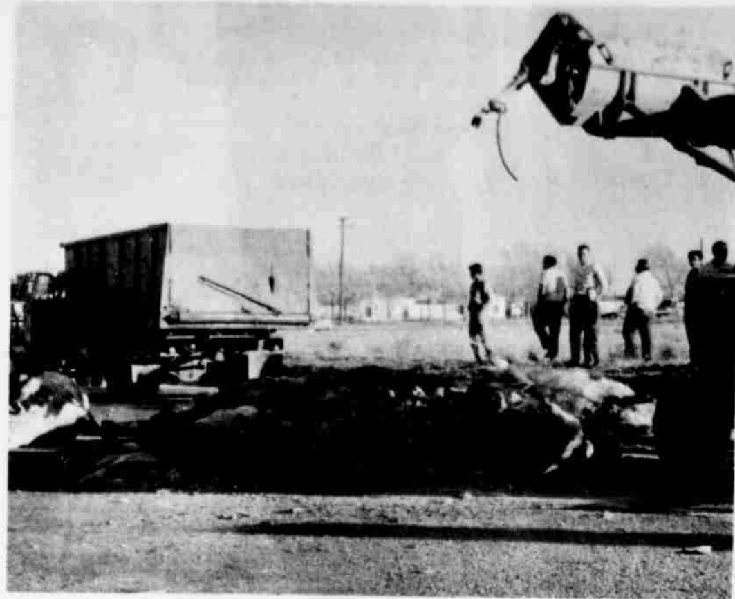
THIS COLLISION between the truck (above) and car (below) at 9th and Harral left dead livestock scattered in the middle of 9th Street here Monday afternoon.