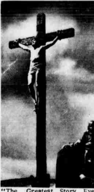
"The Greatest Story Ever Told," a George Stevens Production presented in Ultra Panavision and Technicolor thru United Artists release will open for a limited engagement of seven days at the Palace Theatre on Sunday.

(Continued From Page 1) because the reserve and surplus supply of cotton is at a record high level of nearly 17 million bales. The 1967 program is contingent upon farmer approval at a referendum to be held Dec. 5-9 on continuance of federal marketing quotas on 1967 crop cotton. These quotas which have never been turned down in the past, must be approved by at least two-thirds of the farmers voting in the referendum. The department said that it expects next year's cotton crop may be as much as 2 million bales larger than this year's very small one of 10.2 million bales, which was 4.5 million less than in 1965. This forecast of a larger crop is based upon assumptions of better weather next year and a somewhat larger planted acreage. The department also announced that the final date for filing applications for the sale or lease of cotton allotments is Jan. 3. Producers in 412 cotton producing counties have approved the transfer of allotments to farms outside the county.