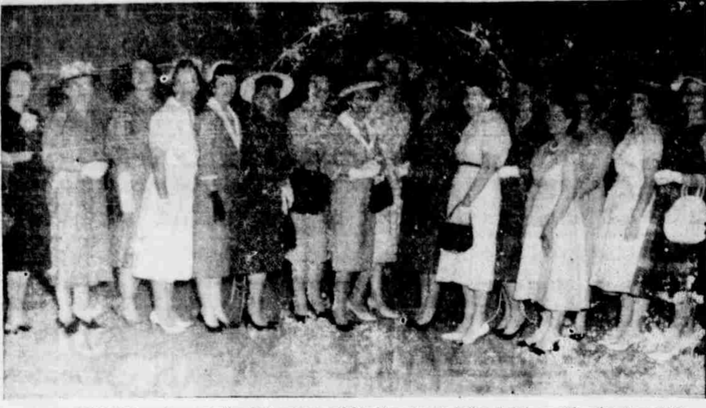
LAMB COUNTY Home Demonstration Club women model fashions for the ladies at their annual spring dress revue