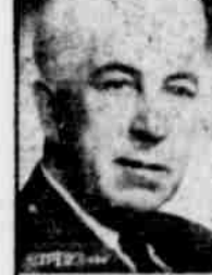
of Travis County