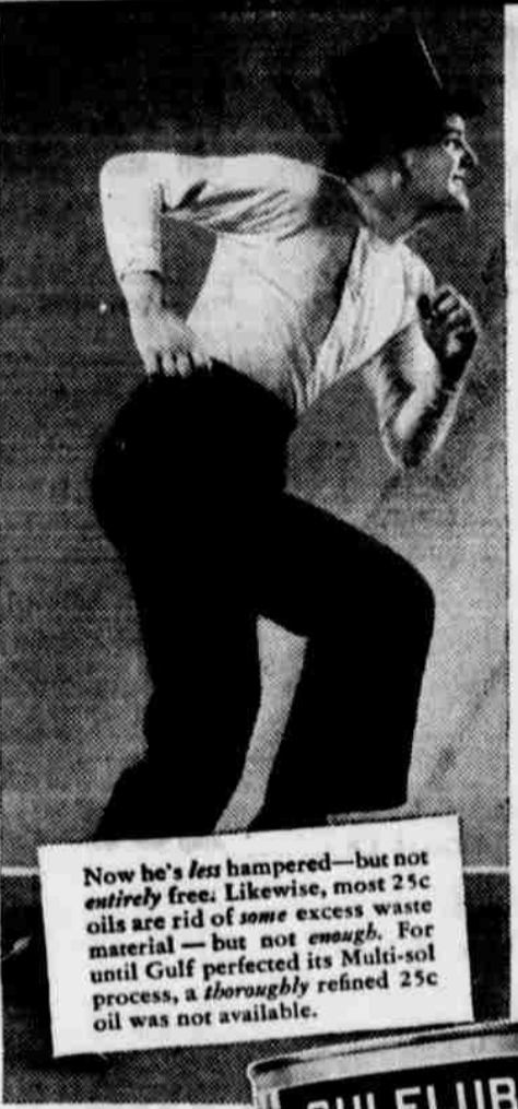
Now he's less hampered—but not entirely free. Likewise, most 25c oils are rid of some excess waste material—but not enough. For until Gulf perfected its Multi-sol process, a thoroughly refined 25c oil was not available.