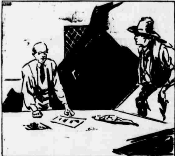
"There's the ten thousand," said Tex. "Trot out that morgage."

gave the lie to the rest of his appearance. Those orbs had a cold, crafty gleam. The look he bent on Ronny caused the hot blood to flame in Johnny's face and his fists