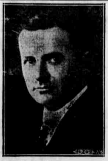
James V. Allred . . . named governor without a struggle.