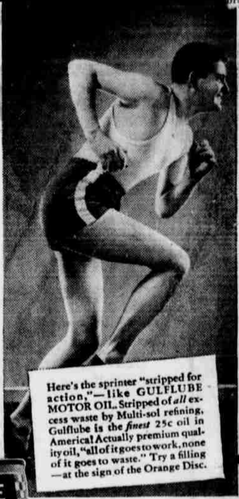
Here's the sprinter "stripped for action,"—like GULFLUBE MOTOR OIL. Stripped of all excess waste by Multi-sol refining, Gulflube is the finest 25c oil in America! Actually premium quality oil, "all of it goes to work, none of it goes to waste." Try a filling—at the sign of the Orange Disc.