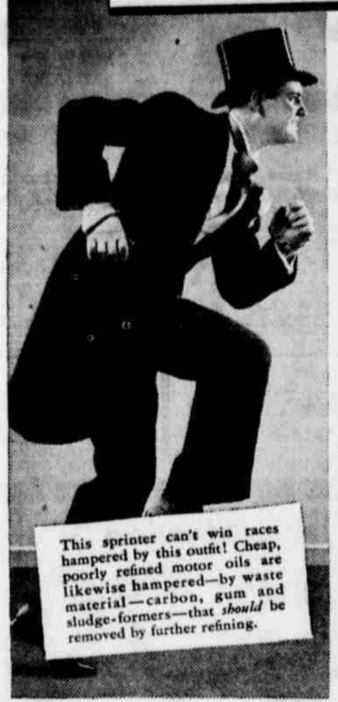
This sprinter can't win races hampered by this outfit! Cheap, poorly refined motor oils are likewise hampered—by waste material—carbon, gum and sludge-formers—that should be removed by further refining.