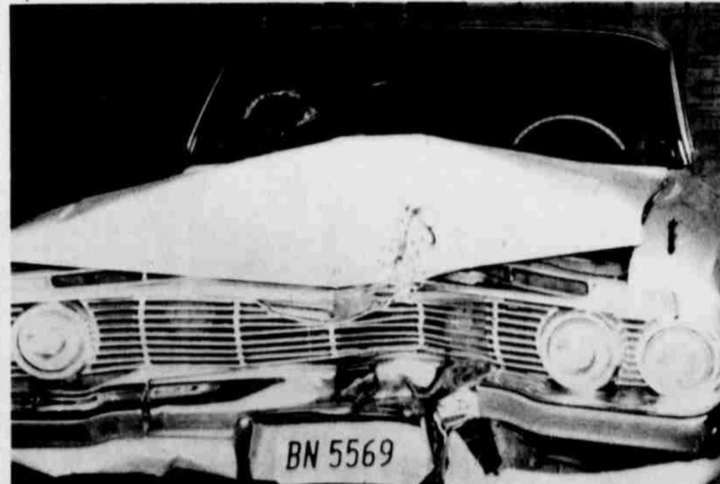
CAR INTO POLE . . . DRIVER INTO WINDSHIELD -- Above is the late model automobile driven by Hayden McCary which went out of control and collided with a light pole near the intersection of 14th and Twitchell. McCary was reaching across the front seat to get something and the car swerved striking the pole. McCary was thrown into the windshield and suffered several cuts about the face.