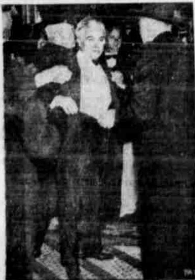
NEW YORK, N. Y. . . . Actor-producer Charlie Chaplin, looking a bit dishevelled, is escorted into the theater by policemen when he "fought" his way through a friendly crowd to see the world premiere of his latest picture, "The Great Dictator."