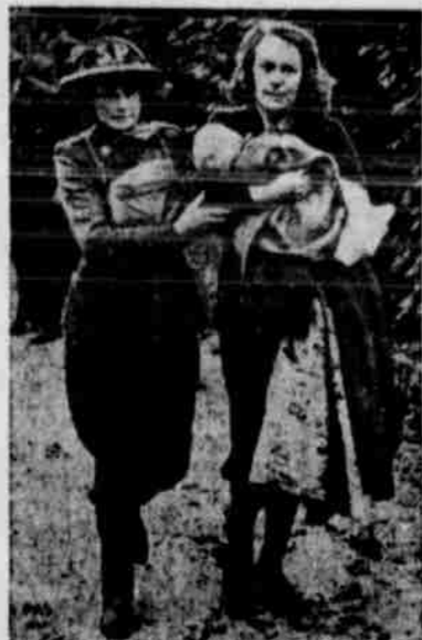
LONDON, England... Terror for her baby is in the face of this London mother as a steel-helmeted woman raid-precautions-worker guides her towards a raid shelter. A.R.P. men and women have covered themselves with glory by their unselfish labors and gallantry during the battle of Britain.