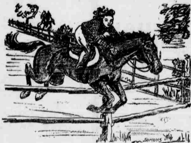
The sight aroused his admiration.

"No," Jeff answered shortly. "She's at home. We came back father unexpectedly. Olive wanted to rest up and I thought I'd run out and see how everybody is . . . get a report of your stewardship." "That's easy," Victor laughed.