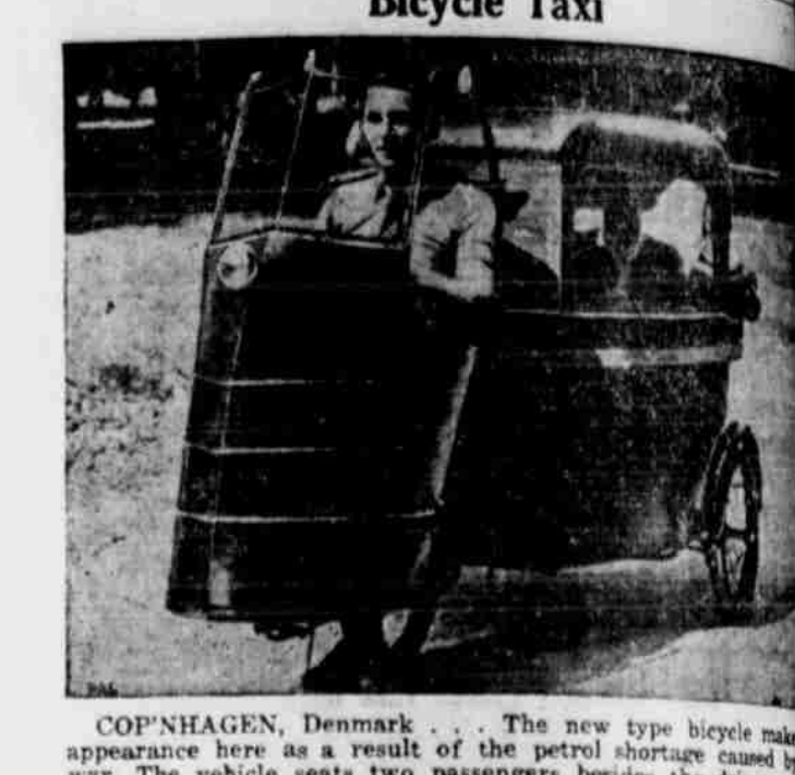
COP'NHAGEN, Denmark . . . The new type bicycle make appearance here as a result of the petrol shortage caused by a war. The vehicle seats two passengers besides the driver.

From The World's Ace Camerame Bicycle Taxi