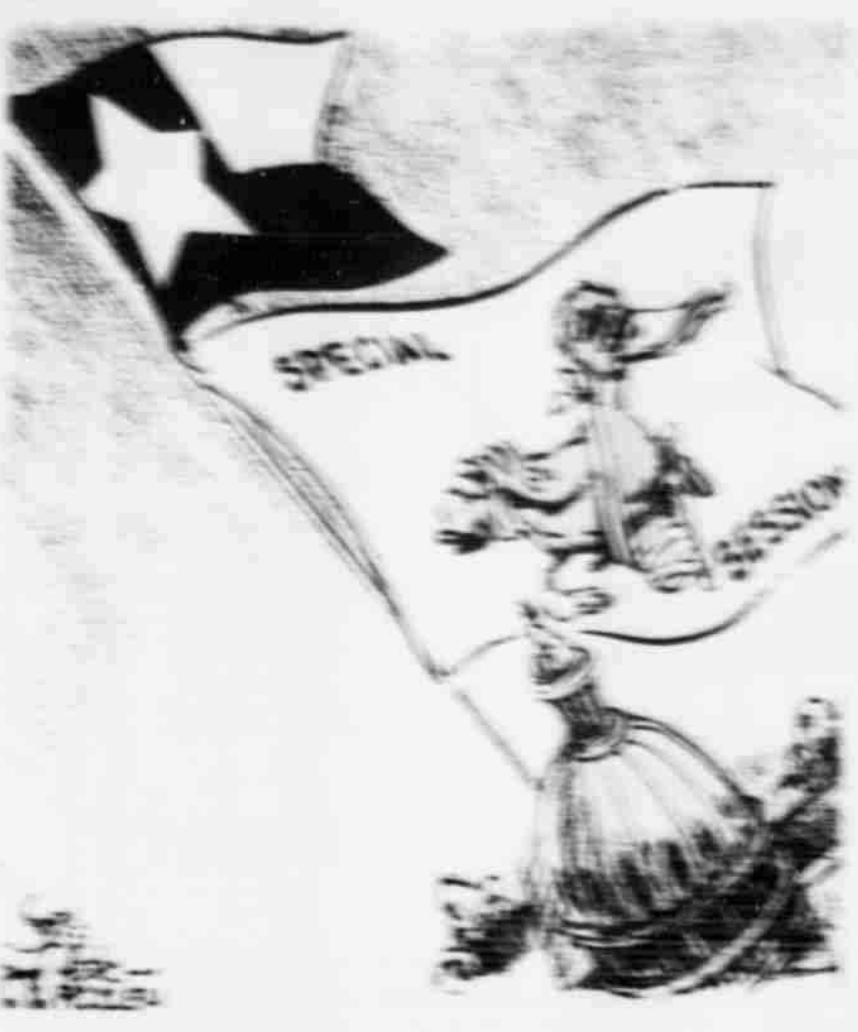
Littlefield and Over Deep