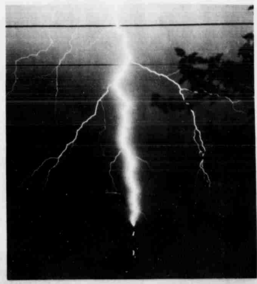
MOTHER NATURE'S fireworks were brightly displayed in the skies during Saturday and Sunday nights of this week, just prior to the July 4 celebration. This display was seen above the large water tower in the western part of Littlefield Sunday.