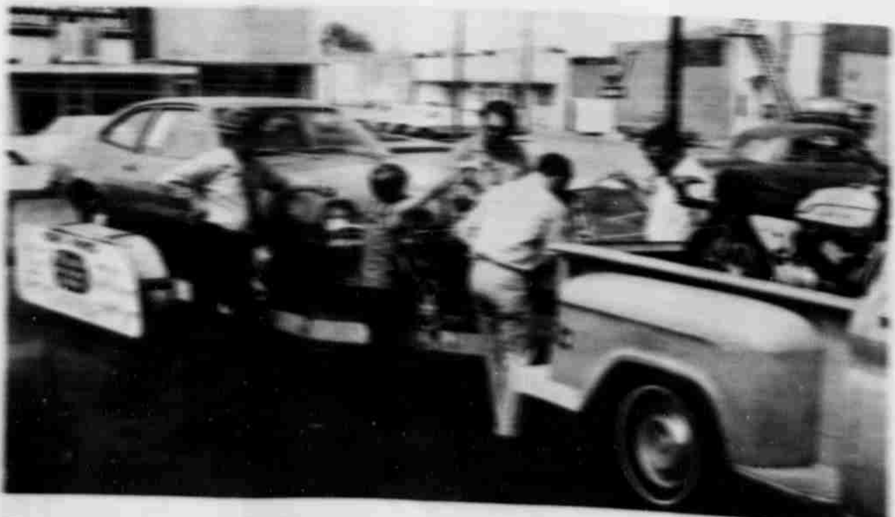
Parade Entries Are Being So... (Caption text is partially obscured)