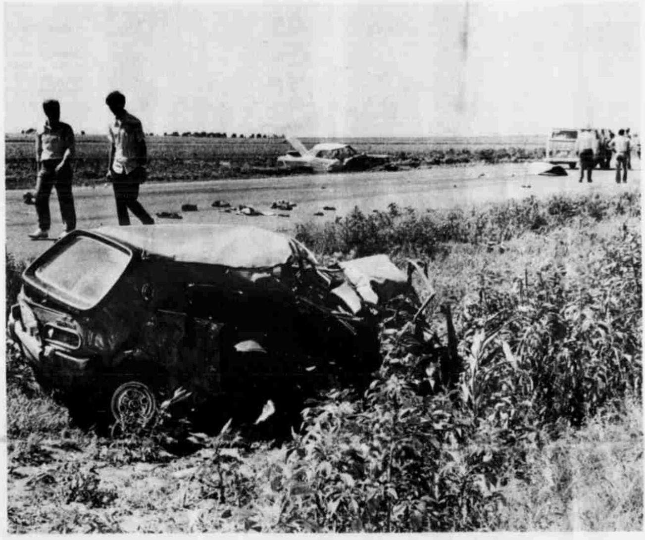
FOUR PERSONS died in this pulverizing crash 1.7 miles north of Littlefield about 4 p.m. Saturday afternoon. Two Irving teenagers going to Otton for a family reunion were killed in the compact car in the foreground. Two of the three occupants of the white car in the ditch in the background were dead on arrival. The car in the foreground was hit head-on by the white car which was passing the van at the far right. The impact sent the small car into the northbound lane where it hit the van. None of the five in the van were injured.

The gay family reunion of the Hackler family at Otton disintegrated into bitter tragedy Saturday afternoon when four out of five persons involved in a grinding head-on crash were killed 1.7 miles north of Littlefield on U.S. 385.