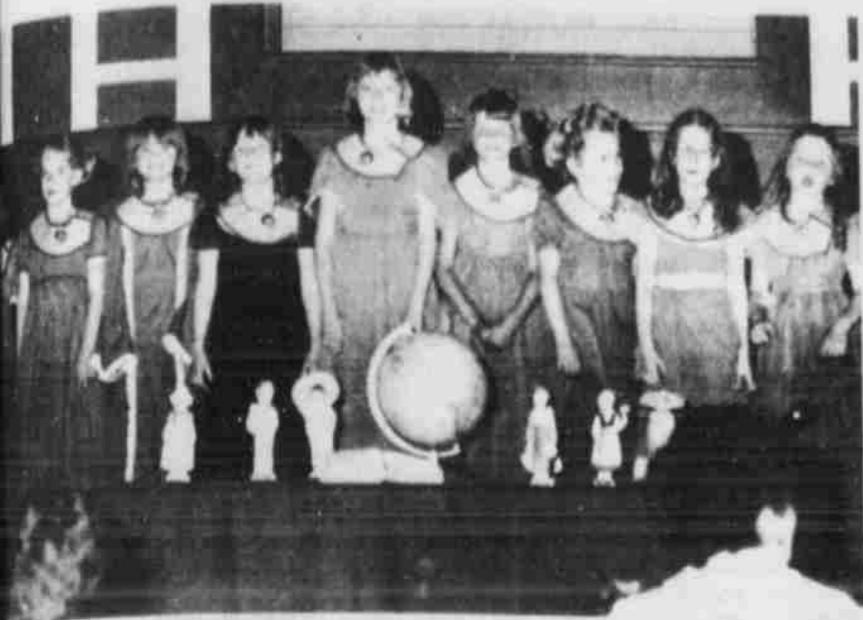
First and Second Grade GA's