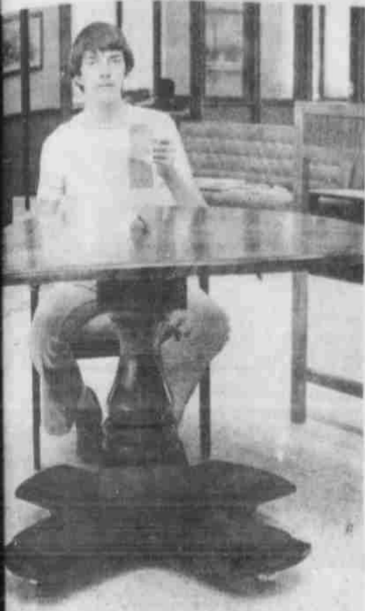
SMITH'S walnut round table placed third in the Regional Arts Fair in Lubbock, and won first place in Austin last year. It is now on display at Security State Bank.