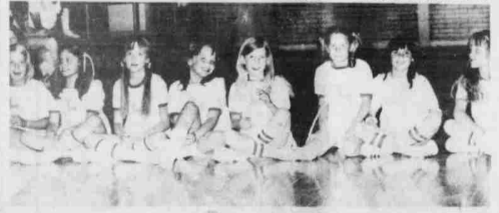
Armes Little Deeres