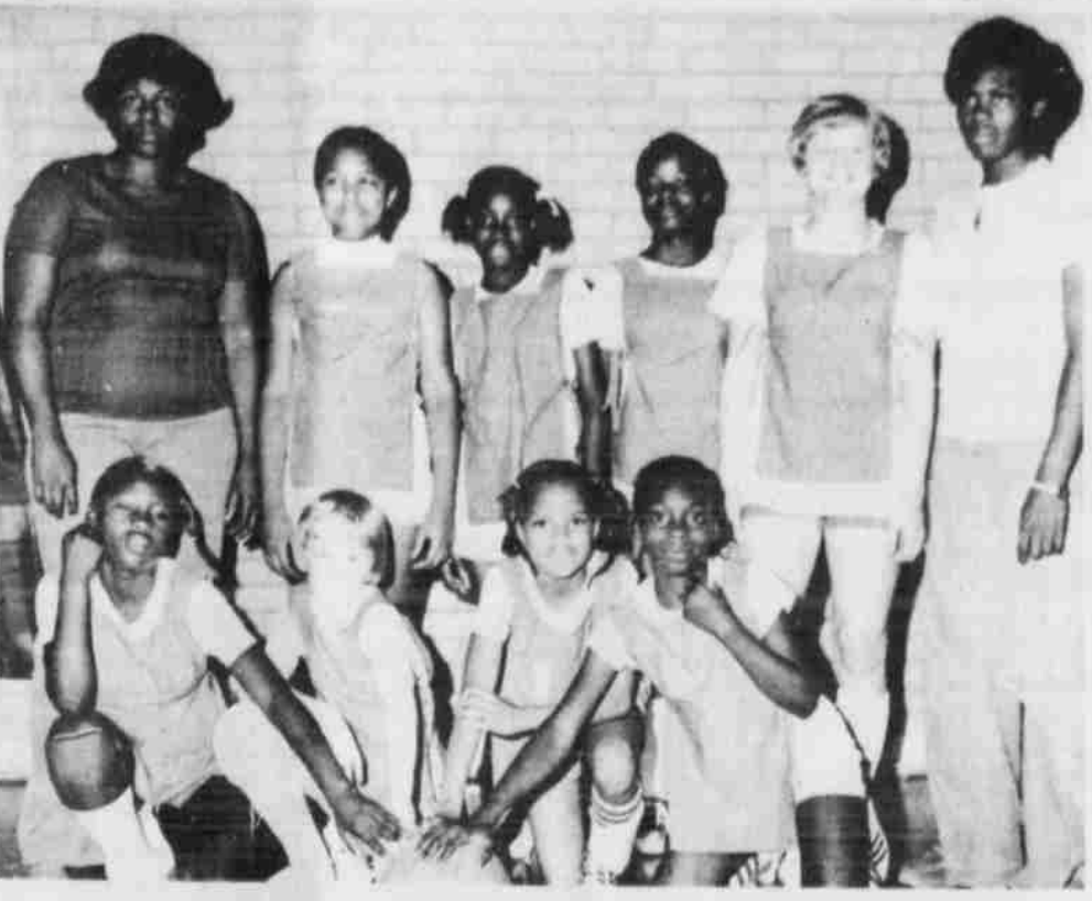
Lamb Co. Electric Chargers