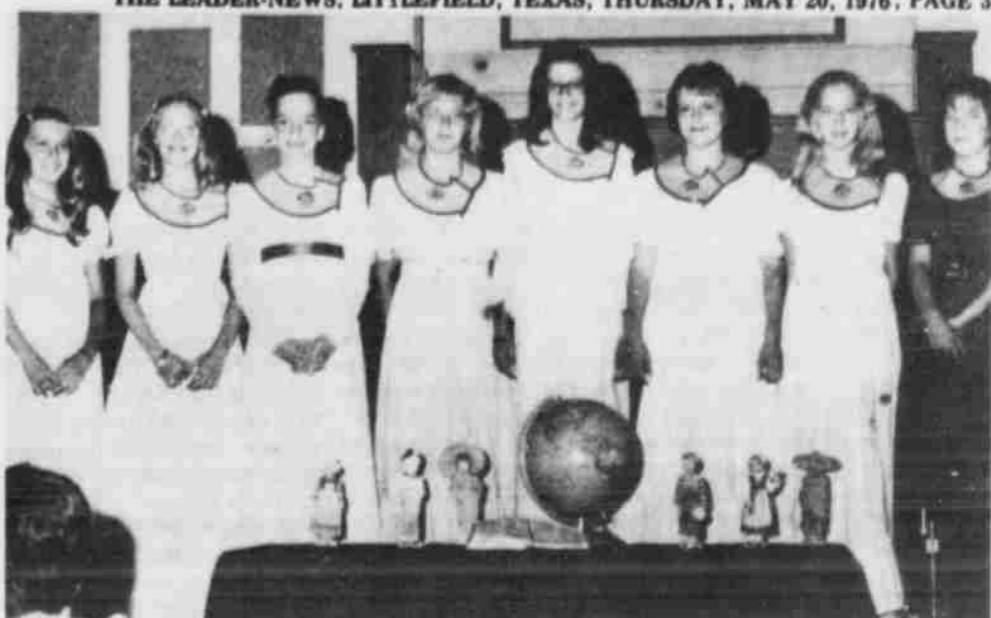
Sixth Grade GA's