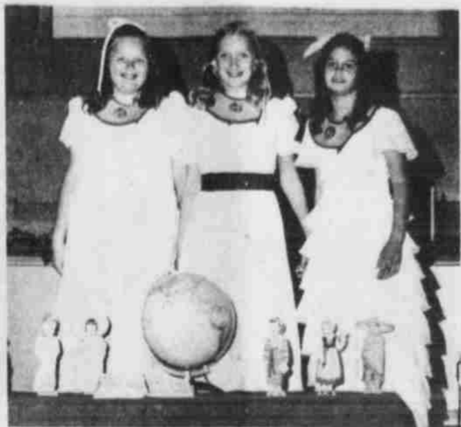
Fourth and Fifth Grade GA's