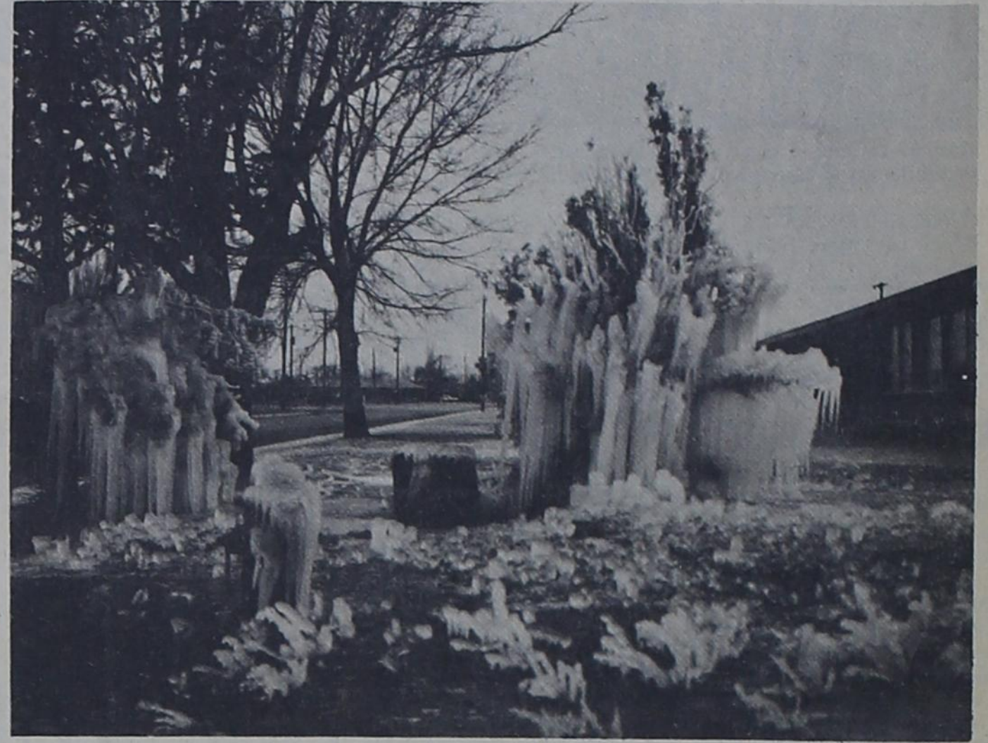
WINTER WONDERLAND -- Although little moisture had fallen locally on Wednesday morning this Winter Wonderland scene at Farwell Elementary School was creating quite a "stir" among students who arrived at the school to find the Fairyland setting.

Approval was given for buying a two-way mobile unit for the highway patrolmen.