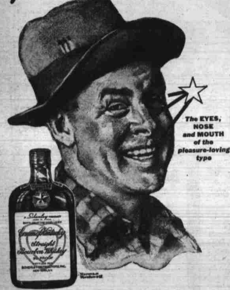
The EYES, NOSE and MOUTH of the pleasure-loving type

Are you the type who yearns for life's pleasures?