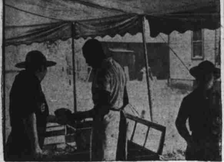
FOOD Hot meals will be carried from central kitchens to be dished out at troop sites like this.

Are you the type who yearns for life's pleasures?