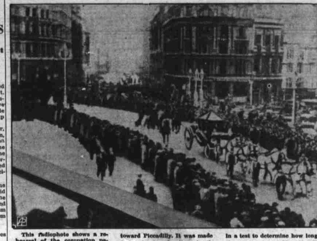
This photograph shows a rehearsal of the coronation parade in London as the procession moved up St. James Street toward Piccadilly. It was made from the broadcasting booth where the procession was timed in a test to determine how long the ceremonies of May 12 will last.