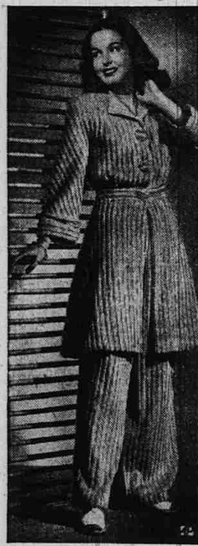
CORDUROY—Lush chenille corduroy is fashioned into a three-piece lounging outfit with college girls especially in mind.

DROP IN AND SEE US! Roy and Veda Carter Are Located Now at 1010 W. Third in a Modern up-to-date Grocery Store. ROY CARTER GROCERY 1010 West Third