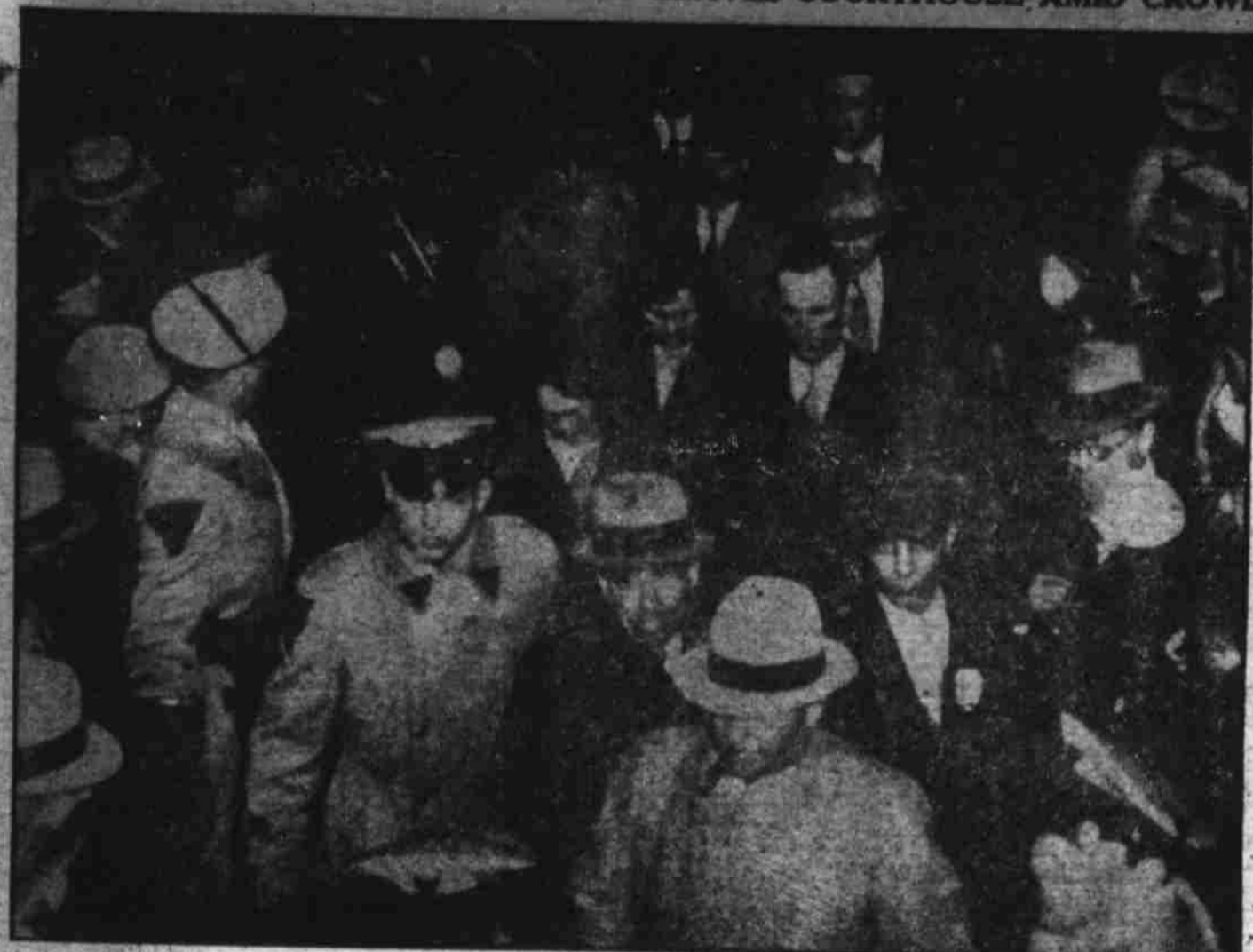
Hemmed in on all sides by a huge crowd, the jury that convicted Bruno Richard Hauptmann of slaying the Lindbergh baby, is shown leaving the Flemington, N. J., courthouse just after bringing in the verdict. The jurors were taken to their hotel for a night of rest before departing for their homes.