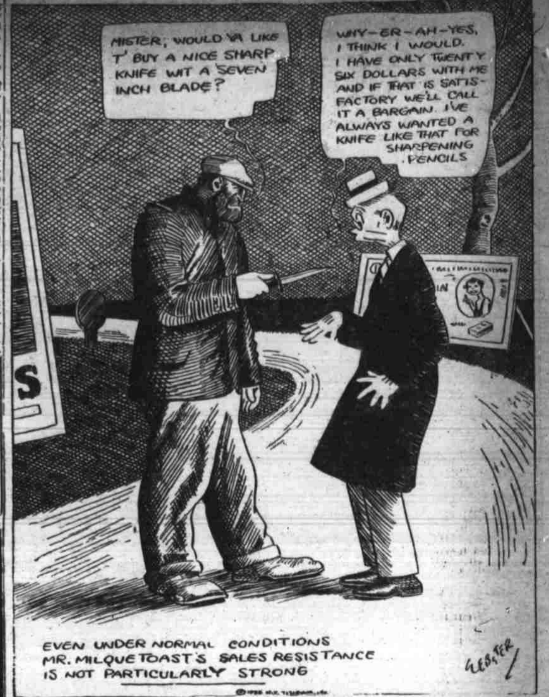
EVEN UNDER NORMAL CONDITIONS MR. MILQUETOAST'S SALES RESISTANCE IS NOT PARTICULARLY STRONG