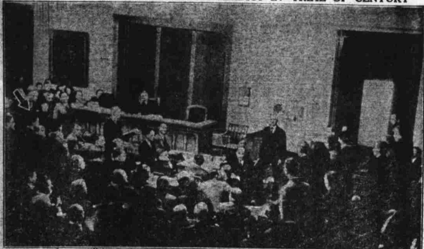
This Associated Press picture shows the dramatic courtroom scene in Flemington, N. J., as the verdict was read to pronounce Bruno Richard Hauptmann guilty of murder in the first degree in the Lindbergh baby case. Hauptmann (indicated by arrow) is shown standing before the court, and the jury is shown standing at right. Hauptmann's attorneys announced plans to request a stay of the death sentence while they make plans to appeal the conviction.