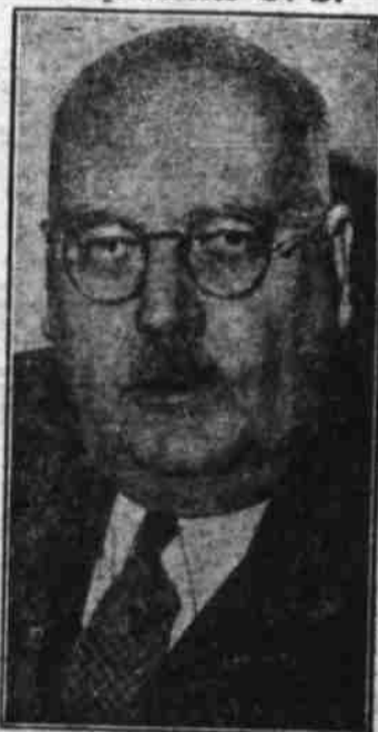
One of the foremost "trouble shooters" of the diplomatic corps, George C. Hanson (above), will represent the United States as charge d'affaires and consul general at Addis Ababa, Ethiopia, where difficulties with Italy are under consideration.