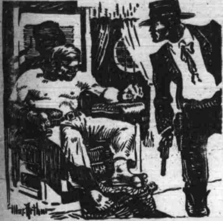
"O, to tie him in this chair!" murmured Rubric.

Rubric hit at the air like a dog, as though this last reproof cut deeper than all that he had passed before. But he spoke quietly when he answered, "I am finished—for this night, gringo!"