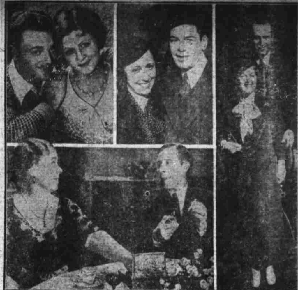
Marriage can be a success in the land of movies and there are numerous couples who furnish adequate roof of the assertion. The ungallant movie Jimmy Cagney (upper left), who elaps women in pictures, has been married 11 years to Frances Vernon; Paul Muni (top, center) has been happily wed for 14 years to Bella Finkler; Harold Lloyd (right) just celebrated the 12th anniversary of his wedding to Mildred Davis; and George Arliss (below) holds the screen record with Florence Montgomery for 36 years of serene married life.