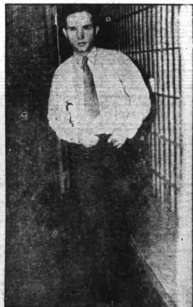
Returned to his cell after hearing sentence of death pronounced upon him for the kidnap-murder of the Lindbergh baby, Bruno Richard Hauptmann presented far from the natty appearance trial spectators had grown to expect. This is the first photograph to be made of Hauptmann in jail since his arrest last fall.