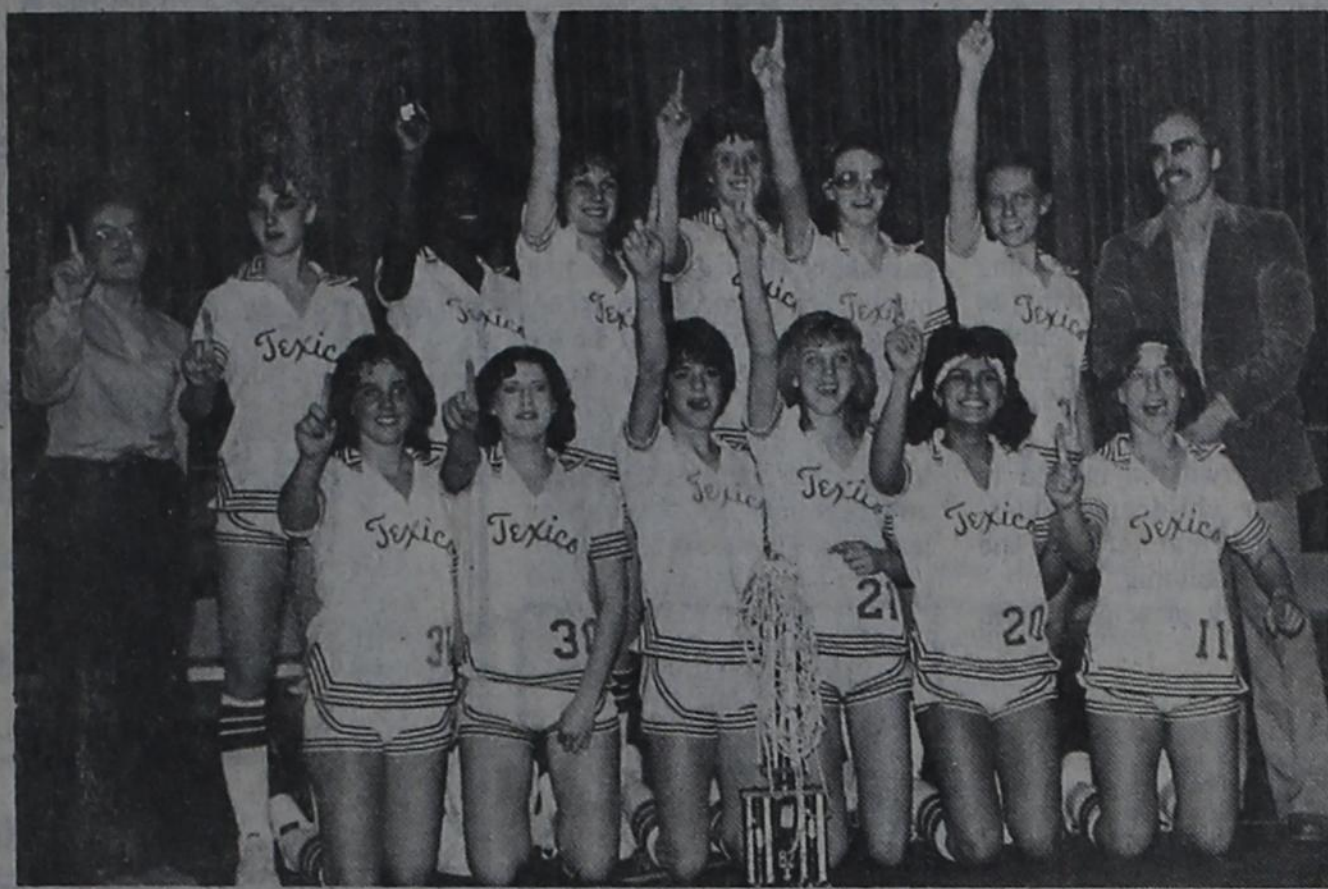
TEXICO LADY WOLVERINES District 6-A Champs

and sent Farwell's team home with their first loss since (Continued on Page 2)