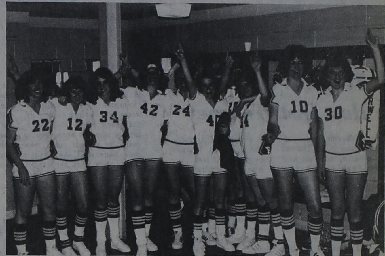
FARWELL STEERETTES District 3-AA Champs