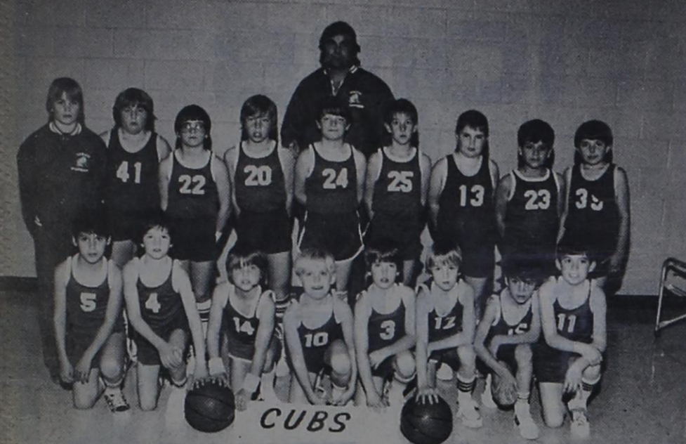
2nd Place Winners

Texico Cubs of Play Inc., of Clovis finished their roundball season in second place after being defeated in the league tournament last weekend. The Cubs, third and fourth graders from Texico Elementary School, took an undefeated