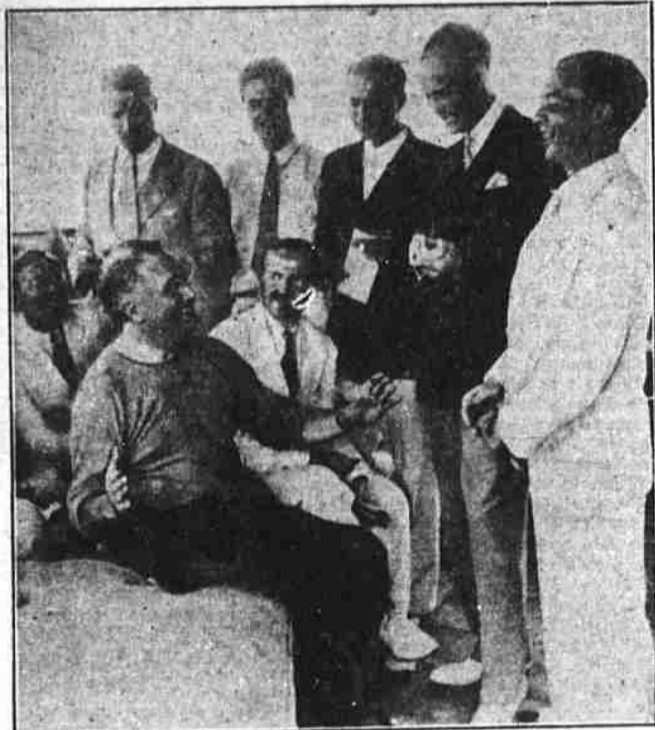
President Roosevelt, vacationing aboard the Vincent Astor yacht...