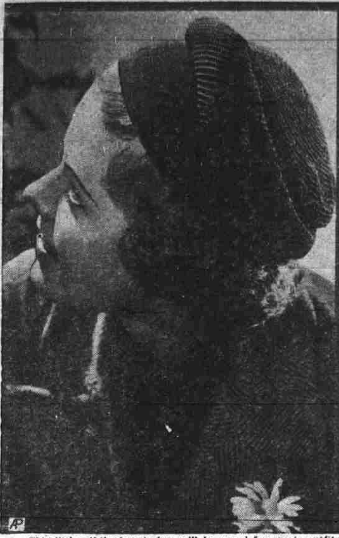
This little off-the-face turban will be grand for sports outfits this winter. It is made of mercerized crochet cotton, worked very tightly so that it is warm and will not stretch out of shape.

CROCHETED TURBAN SMART TO TOP OFF SPORTS TOGS