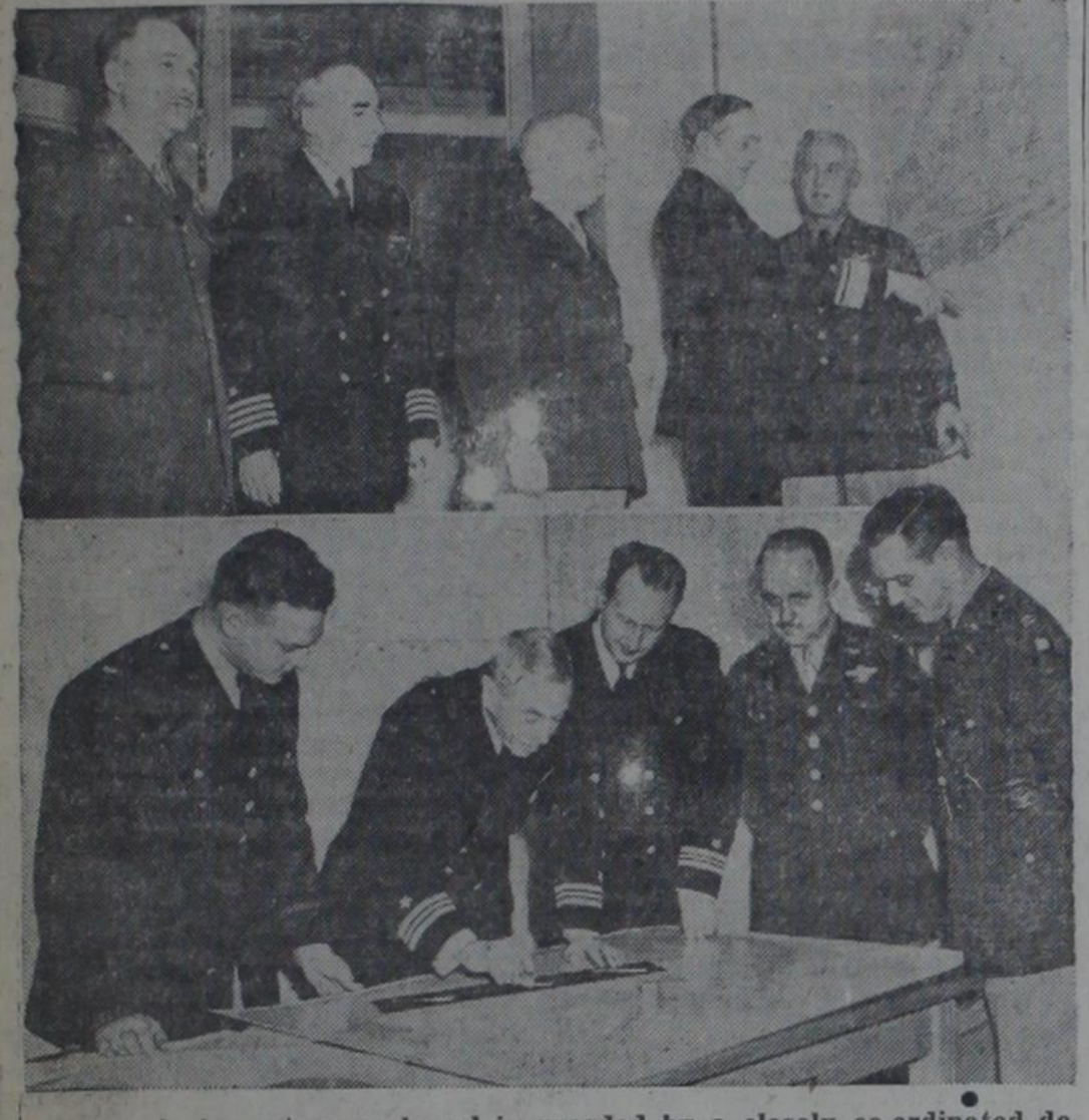
America's eastern seaboard is guarded by a closely co-ordinated defensive and offensive system, by land, sea and air, with leaders working in unison at secret headquarters somewhere in the New York area. Above are two views of army and navy commanders conferring in the plotting room of the secret joint headquarters.