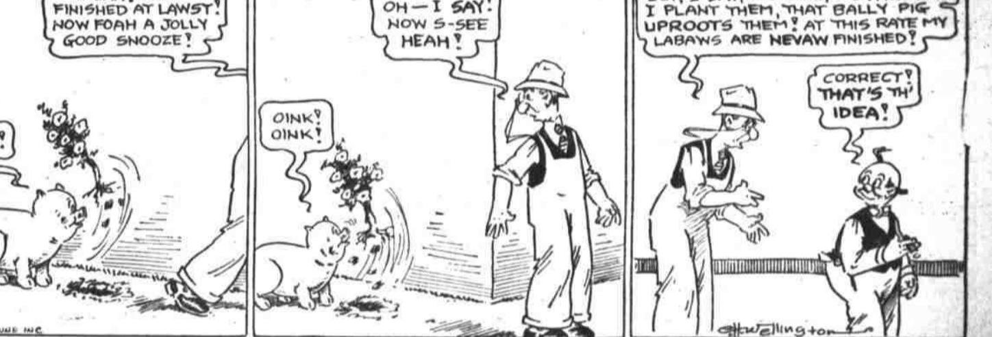
No Soapy by Don Flowers