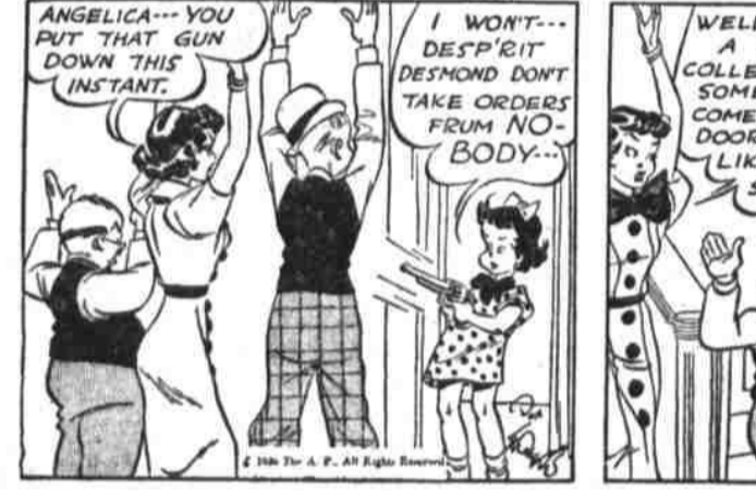
SCORCHY SMITH Trademark Reg. Applied For U. S. Patent Office