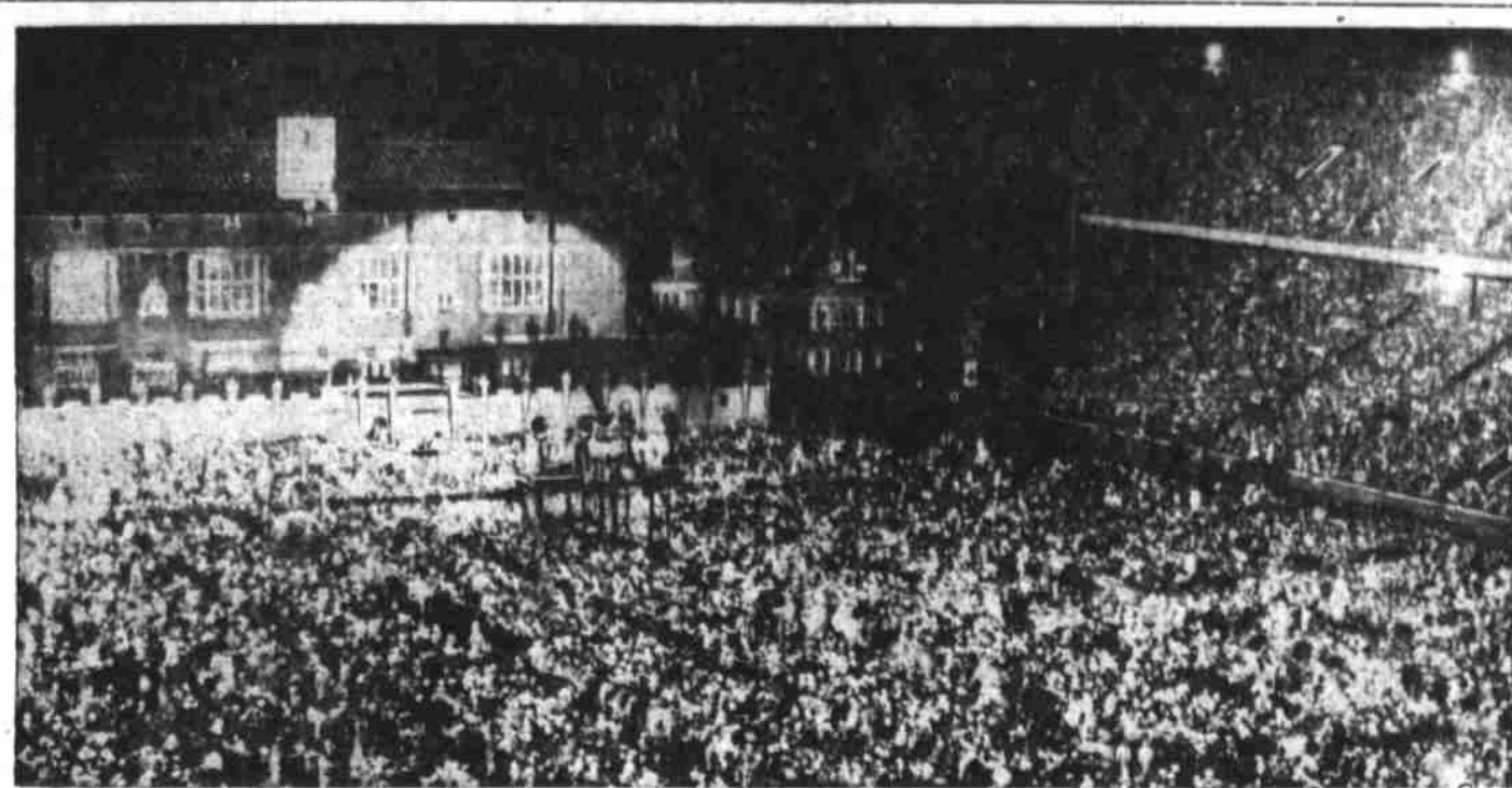
This night view of Franklin Field, Philadelphia, shows the 100,000 listeners who heard President Roosevelt and Vice-President John Garner accept renomination by the democratic national convention...