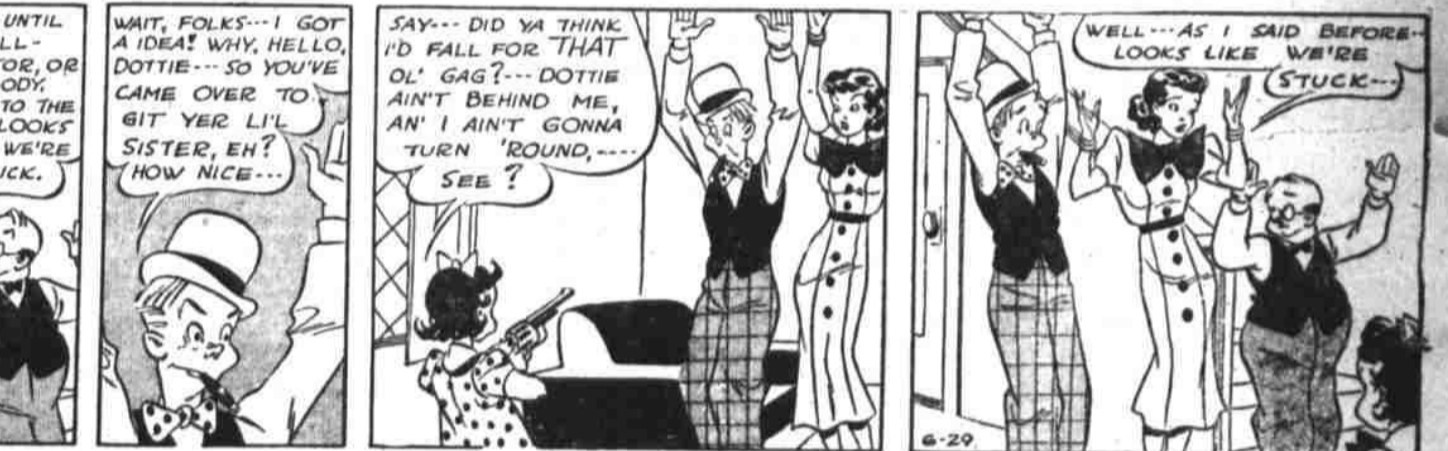
Concentrated Concern by Noel Sickler