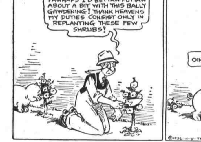
DIANA DANE Trademark Reg. Applied For U. S. Patent Office