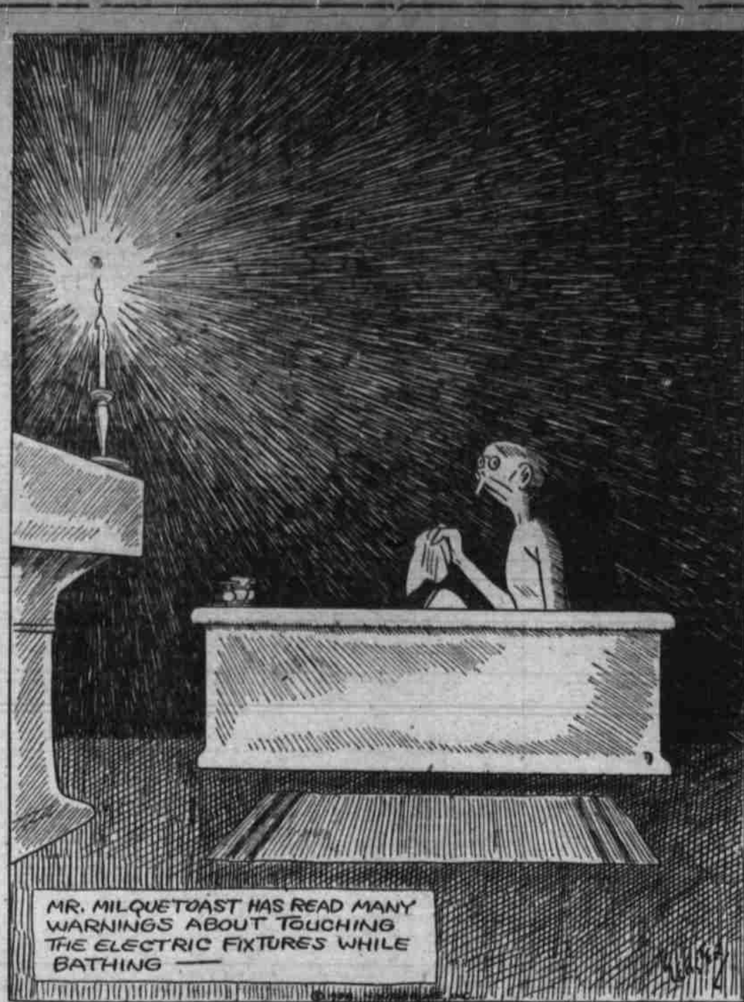
MR. MILQUETOAST HAS READ MANY WARNINGS ABOUT TOUCHING THE ELECTRIC FIXTURES WHILE BATHING