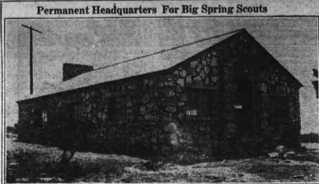
Permanent Headquarters For Big Spring Scouts

Located atop a rugged knoll, covered by evergreen cedar and near a rock cliff overlooking the playground and picnic grounds in City Park, is this beautiful structure—the Big Spring Boy Scout Hut. This afternoon at 5 o'clock it will be dedicated formally. The hut was built of native stone, quarried almost upon the site itself, by the city of Big Spring as a part of its improvement program in City Park.