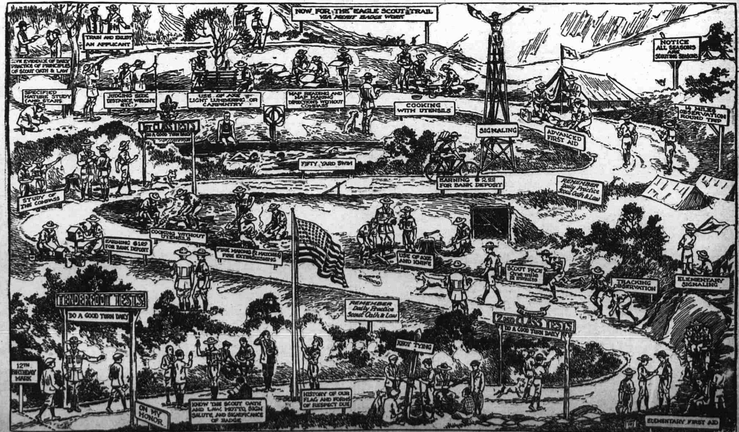
THE BOY SCOUT TRAIL TO CITIZENSHIP THE TRAIL FOR ADVANCEMENT FROM TENDERFOOT TO FIRST CLASS RANK