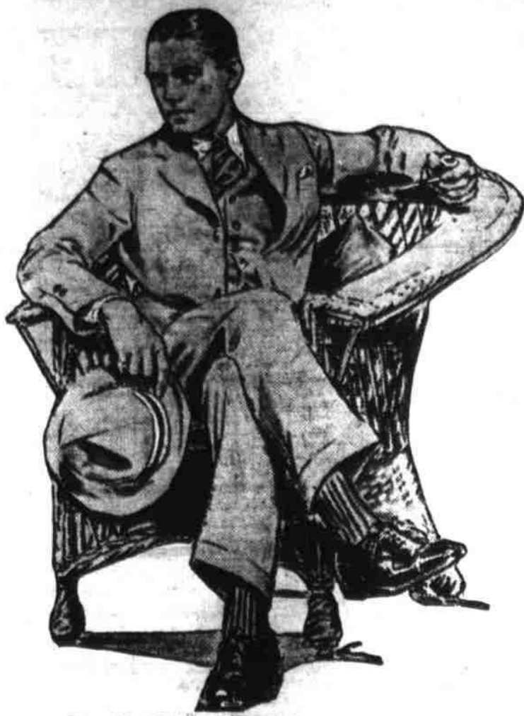
Copyright 1924 Hart Schaffner & Marx