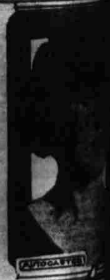
Former wife of the Smith, one of the women in the Senate investigation of Attorney General Cummings' administration of the post office.