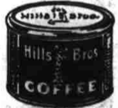
In the original Vacuum-Pack which keeps the coffee fresh.

© 1924, Hills Bros. WOOTEN GROCER CO., Big Spring, Texas. Exclusive Wholesale Distributors