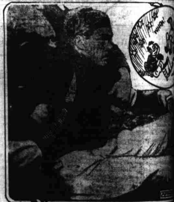
First arrivals to the Prince of Wales following his last horse race and after being kicked and collar-bone broken by another horse. Despite protest, the King, and the people, he refuses to give up the sport.