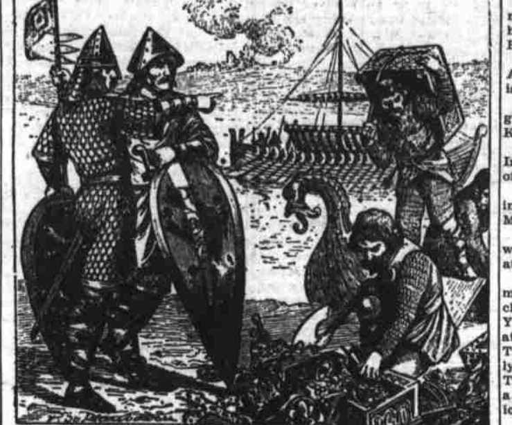
1000 YEARS AGO: Norse raiders seek new conquests. In the background, one of their long ships.

AP Feature Service Fair-haired, blue-eyed fighters swarmed out of the foggy north centuries ago and struck terror into Europe.