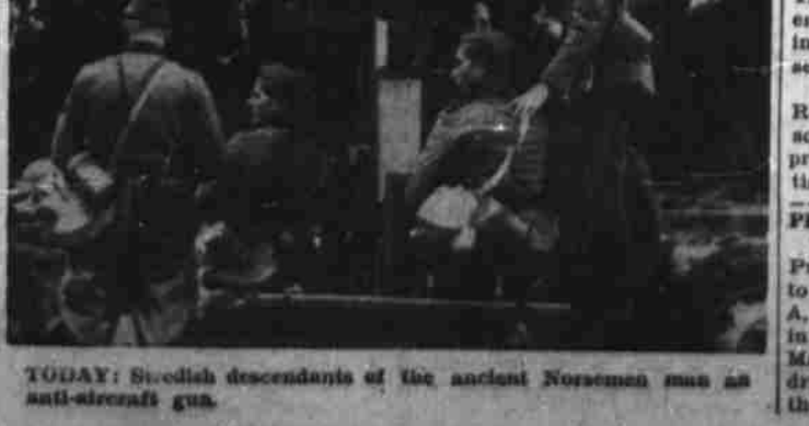
TODAY: Swedish descendants of the ancient Norsemen man an anti-aircraft gun.

FLUG DRILLED TULSA, Okla., April 24 (AP)—Pure Oil Co. was preparing today to wash in its No. 1 Quintin Little-A, Red River basin discovery well in CW 1-2 NE NE of 28-58-7E, Marshall county; Cement plug was drilled and the bit was taken off the tubing.