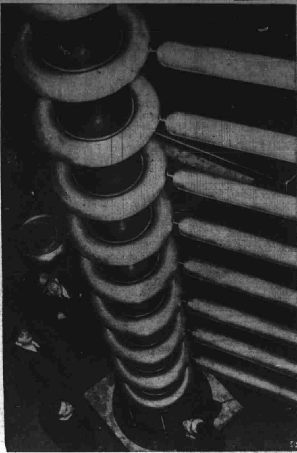
IT'S COLOSSAL IN A BIG WAY —This is a new 1,400,000-volt x-ray tube, most powerful in the world, at Pittsfield, Mass., where it is to have tests before shipment to U. S. Bureau of Standards at Washington. The tube, 28 1/2" high, will duplicate the activity of $150,000,000 worth of radium—more than is now in use in the entire United States.