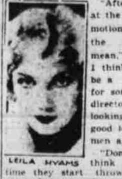
LEILA HYAMS think it's about time they start throwing some more faces on the screen that don't look like twin sisters of the devil's wife.