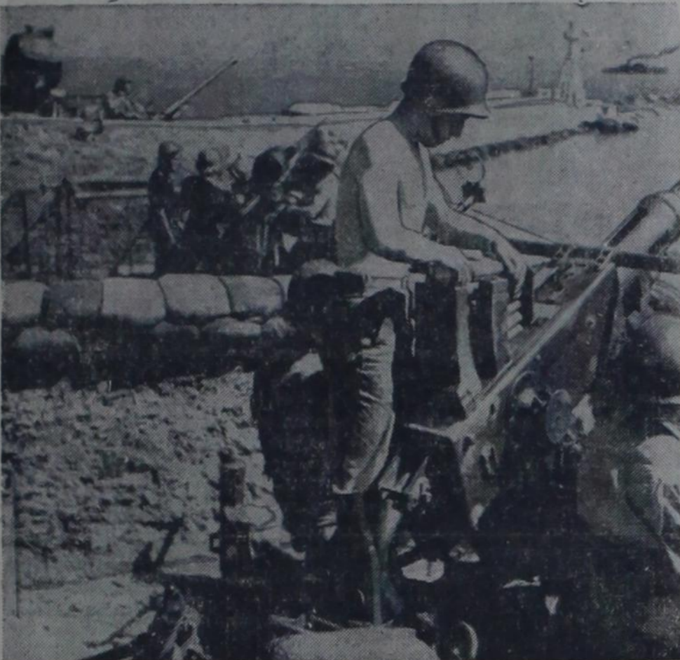
Anti-aircraft gunners of three United Nations are seen working side by side as they protect an Allied-held North African port from Axis air attacks. In the foreground an American unit mans a Bofors gun, while just behind them is a French crew servicing their Oerlikon gun. In the far background is a British crew with another Bofors.