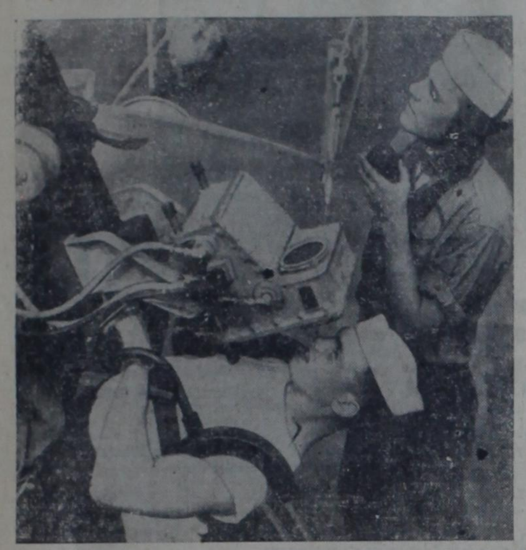
Arched backwards into an almost horizontal position, a young gunner peers through his sighting device while operating a light auti-aircraft cannon. The man at right is a "talker" who relays firing instructions from the control officer. This picture was made aboard a destroyer escort anti-submarine vessel.