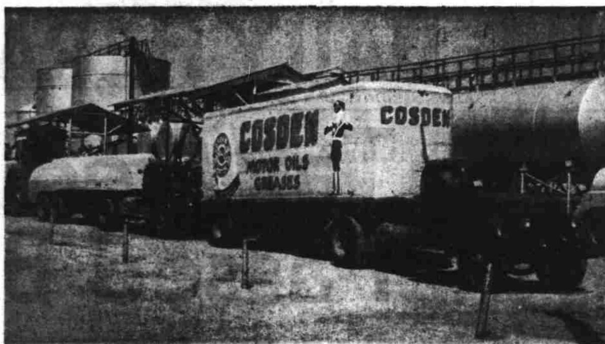
POWER TO YOU —Yes, this may be power to you, or your neighbor or anyone of thousands upon thousands of West Texans who have discovered that Cosden's higher octane gasoline and motor oils give extra performance and pep to their cars. Here is but a fraction of the big fleet of truck tank-wagons which distributes Cosden products over a wide area of Texas and New Mexico, making sure that regardless of where you are in the Southwest, when you say "fill 'er up," pumps can draw on a good supply of Cosden gasoline.