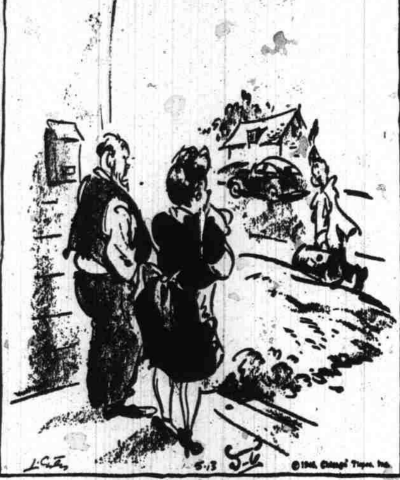
"Pshaw! The peace-time Army may do wonders for Junior, dear. Who knows, he may even learn to say 'Yes, sir' instead of 'Oh, yeah!'"