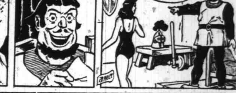
"Pshaw! The peace-time Army may do wonders for Junior, dear. Who knows, he may even learn to say 'Yes, sir' instead of 'Oh, yeah!'"