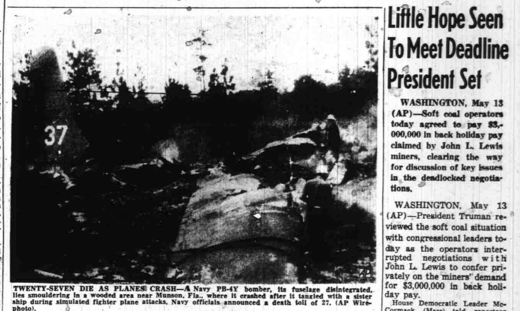
TWENTY-SEVEN DIE AS PLANES CRASH—A Navy PB-4Y bomber, its fuselage disintegrated, lies smoldering in a wooded area near Munson, Fla., where it crashed after it tangled with a sister ship during simulated fighter plane attacks. Navy officials announced a death toll of 27.