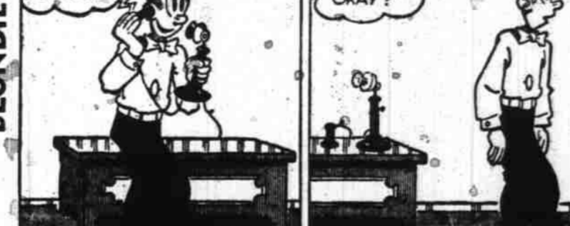
"Pshaw! The peace-time Army may do wonders for Junior, dear. Who knows, he may even learn to say 'Yes, sir' instead of 'Oh, yeah!'"