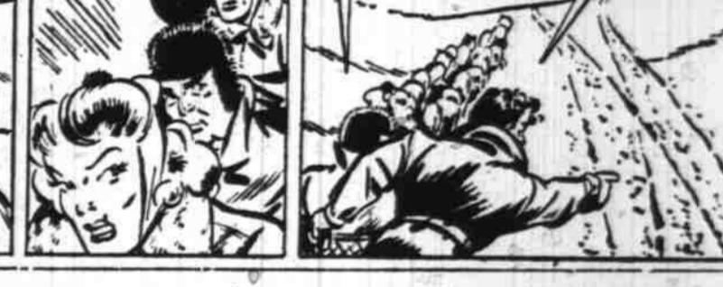
"Pshaw! The peace-time Army may do wonders for Junior, dear. Who knows, he may even learn to say 'Yes, sir' instead of 'Oh, yeah!'"