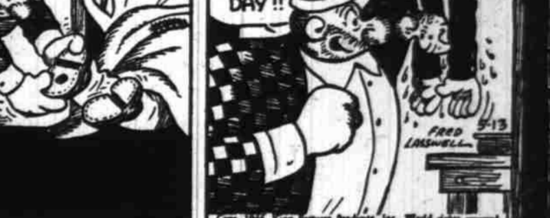
"Pshaw! The peace-time Army may do wonders for Junior, dear. Who knows, he may even learn to say 'Yes, sir' instead of 'Oh, yeah!'"