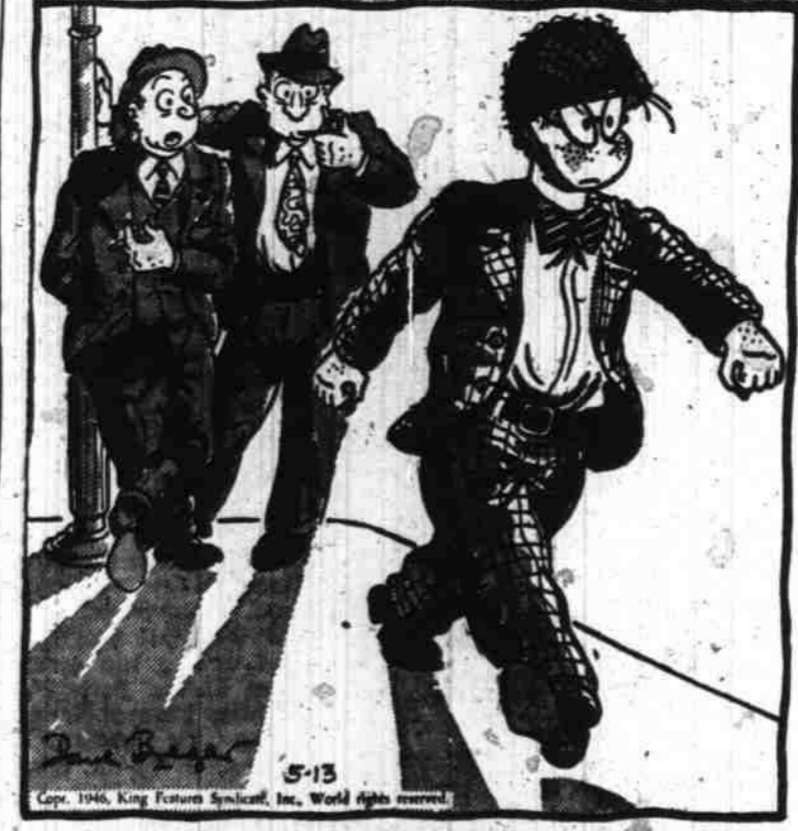
"That's what he's gonna wear EVERY May 13th—the anniversary of his induction, back in 1941!"

Experiments with baby chicks indicate that their eyes are impaired from prolonged exposure to ultra-violet light.