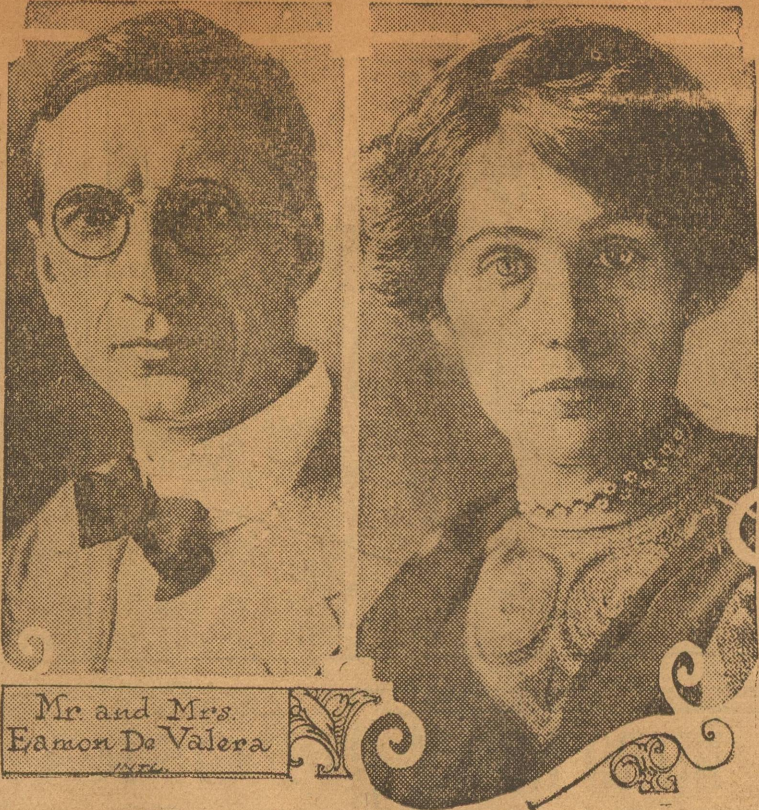
Mr. and Mrs. Eamonn De Valera

Mrs. Eamonn de Valera has presented the fighting former president of the Irish republic with twin sons at their Dublin home.