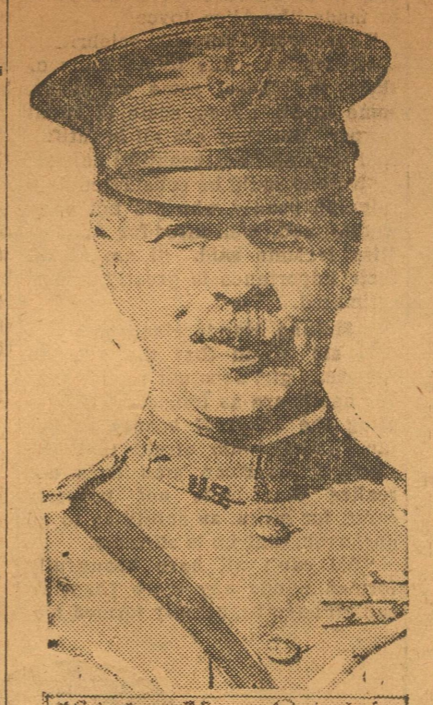
Major Gen. Mason M. Patrick.

Major General Mason M. Patrick, chief of the Army Air service, has just been awarded his double wings as a qualified air pilot, despite the fact that he is 60 years of age. The majority of airplane officers are in their early twenties, and it was a belief in the service that older men were not qualified to make good pilots.