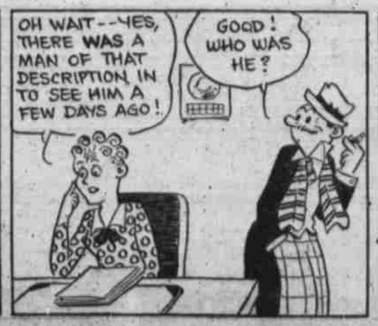
That's A Question

Trademark Reg. Applied For U. S. Patent Office