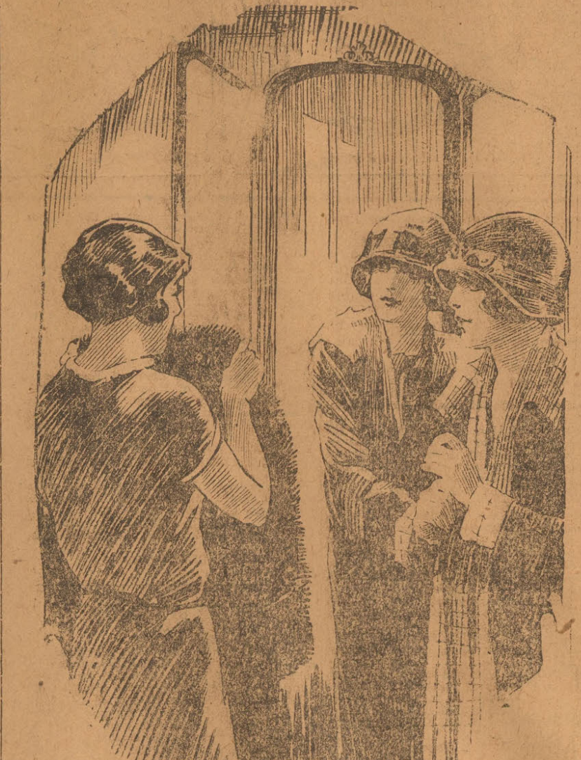
The coat May wanted was a soft gold-colored one of mink.

never saw a woman spend that much money in so little time," the woman remarked to the head of her department, as she watched May and Carlotta disappear down the Boardwalk. "I wonder who she is?" You're not a bit like any other woman I've ever known."