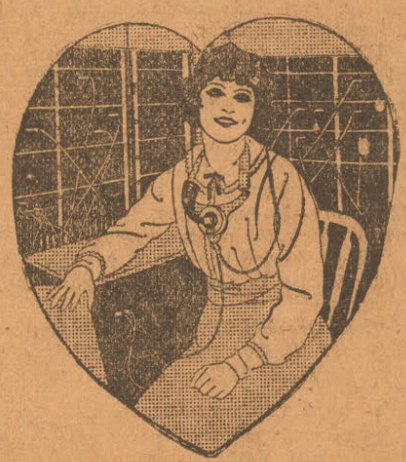
HERE'S THE GIRL WITH THE JAZZ HEART

A blonde. She chews gum. She works a switchboard in a New York hotel and plugs in on the big cabarets to hear the music. Jazz is her meat, her drink, her very life. And beneath all her hardness, and slang and loud clothes there's a great big, understanding heart.