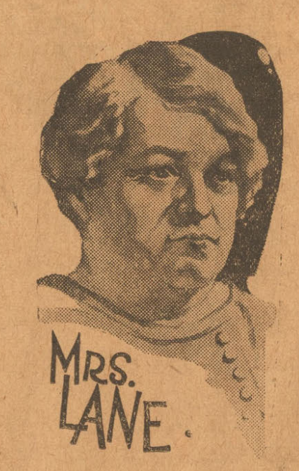
An invalid, and always boasting about it.