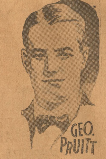
Who tried not to let his money spoil him.