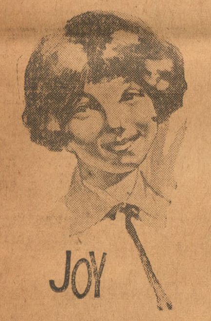
Nine years old and hardboiled.