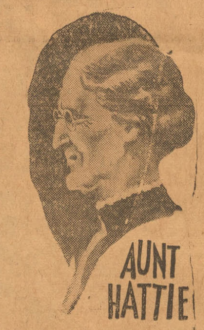
Who meant what she said and said what she meant.