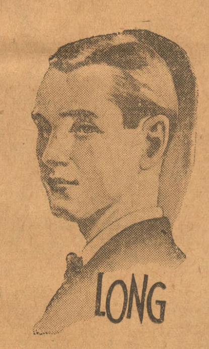
The family sheik. They called him Long for short.