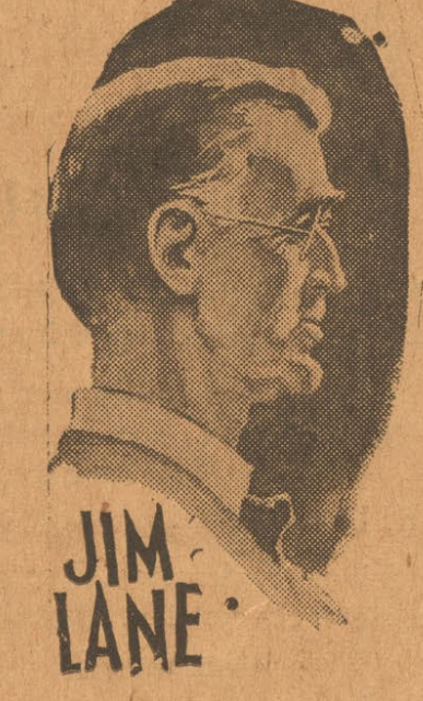
The patient, plodding father.