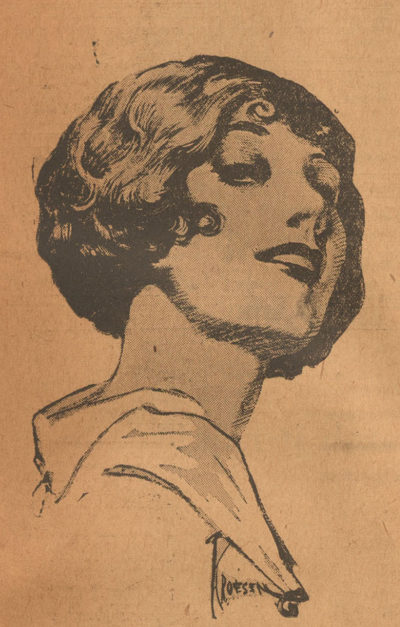
Cherry Lane, the selfish sister who was beautiful and knew it.

These are some of the characters that appear in the greatest serial story of the year