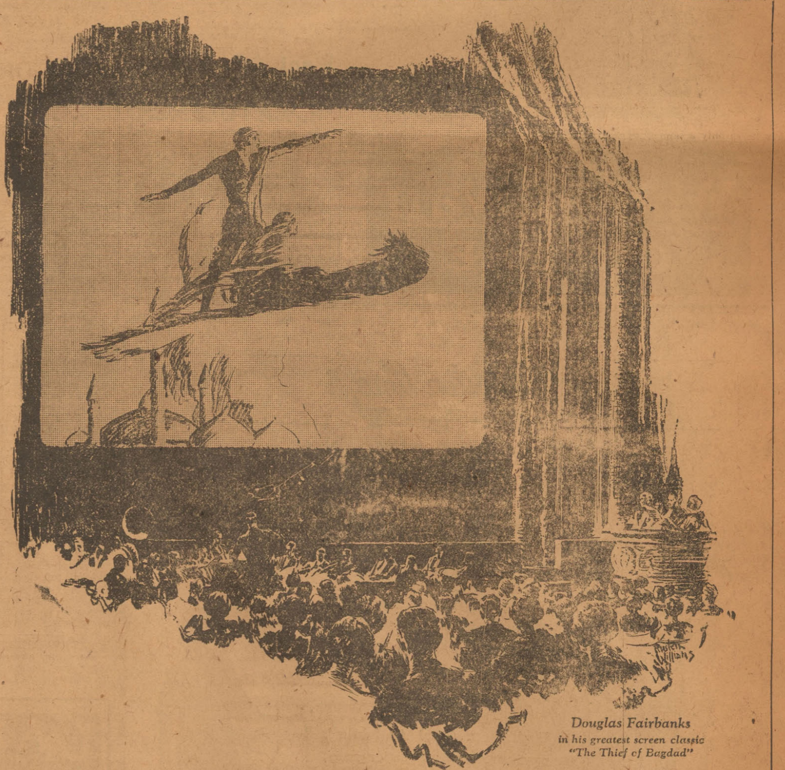
Douglas Fairbanks in his greatest screen classic "The Thief of Bagdad"

OILBELT MOTOR CO. INC. Ranger Eastland Breckenridge Graham