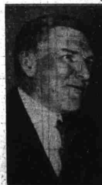
George N. Peek of Moline, Ill., is scheduled to become administrator of the farm relief bill.