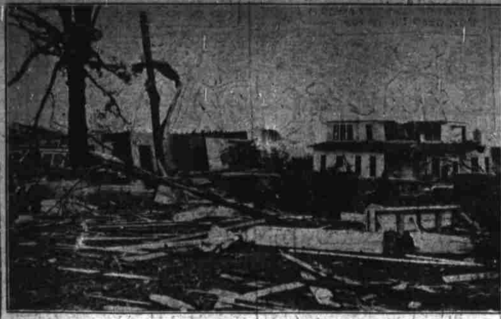
This picture shows damage caused in a residential section of Minden, La., by May day tornadoes which tore through northern Louisiana and southern Arkansas, killing scores and making hundreds homeless.