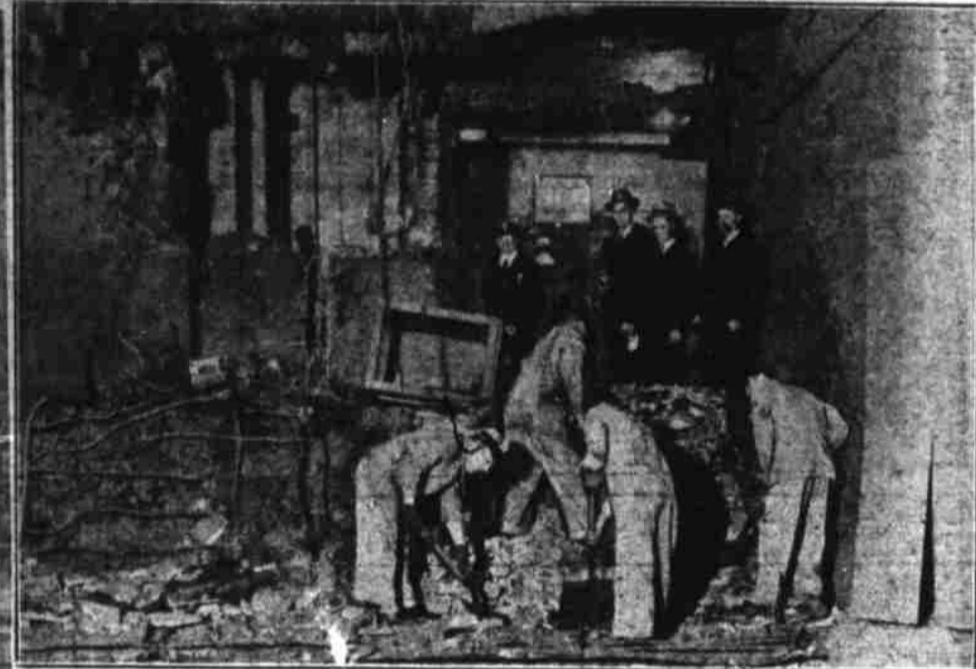
This was a sample of damage caused by May day bombs in Chicago's loop. Thousands of windows were broken and damage in five bombings as estimated at from $150,000 to $200,000. Workmen here are shown clearing away debris caused by the bombing of the rear of the Illinois Bell Telephone company's downtown building.