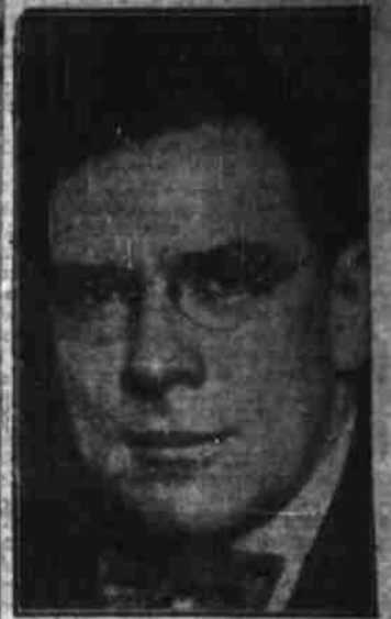
Maxwell Anderson, author of "Both Your Houses" produced by the Theater Guild, receives the Pulitzer drama award.