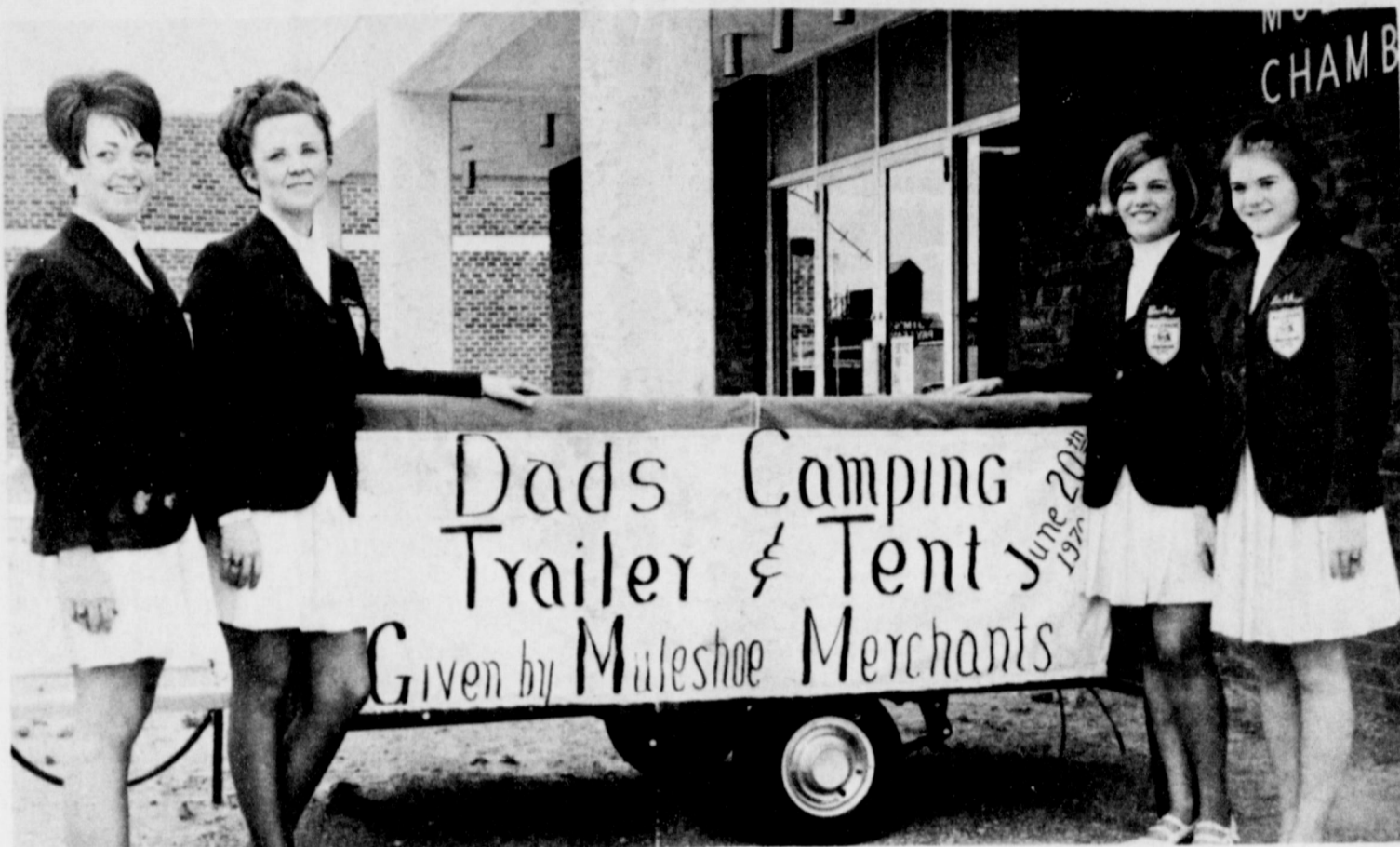
DAD'S CAMPING TRAILER AND TENT--The four Muleshoe Ambassadors are pictured with Dad's Camping Trailer and Tent which will be given some lucky man on the day preceding Father's Day, June 21. A drawing for the camper will be held on the Courthouse Parking Lot on Saturday, June 20. The four