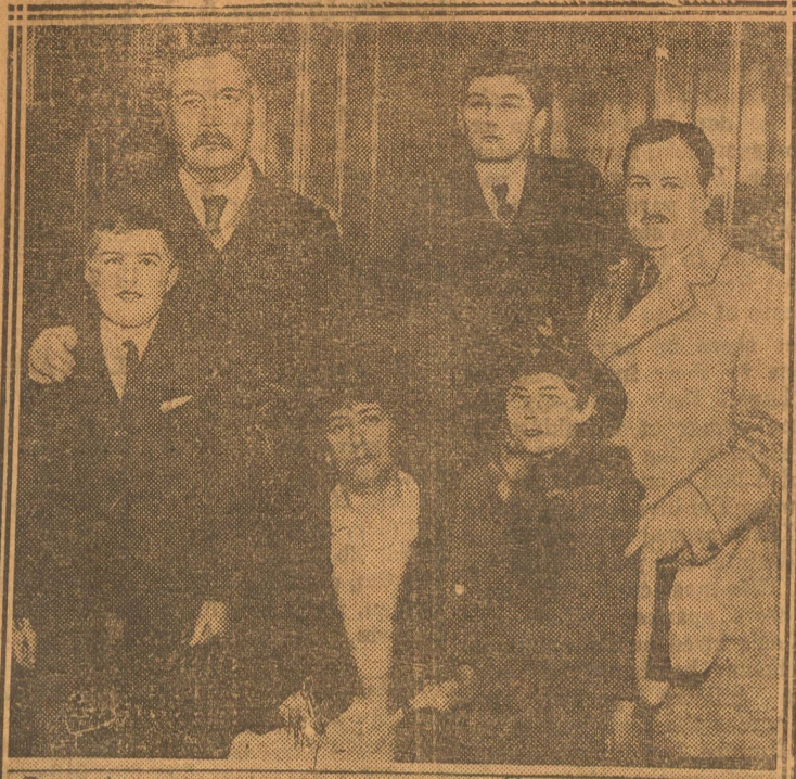
Sir A. Conan Doyle and Family.