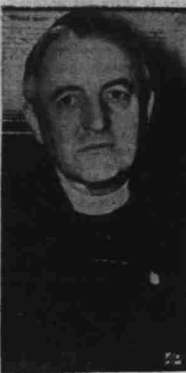
CATHOLIC EDUCATOR "Silenced" by Archbishop—The Rev. Leonard Feeney, S. J., 52, Catholic educator and author, is shown in his quarters at the St. Benedict's center, Cambridge, Mass., after he was silenced by Archbishop Richard J. Cushing of Boston. The Jesuit priest supported three Boston College instructors recently dismissed after they attacked the Jesuit school of teaching heresy. In a statement the Rev. Feeney said he was "silenced" because "I believe there is no salvation outside the Catholic Church."

He declared that "no incidence figures are available on cancer of the hands and forearms occurring in grease pit workers of service stations recently mentioned (by another scientist)." "Since high-pressure, high-tem-