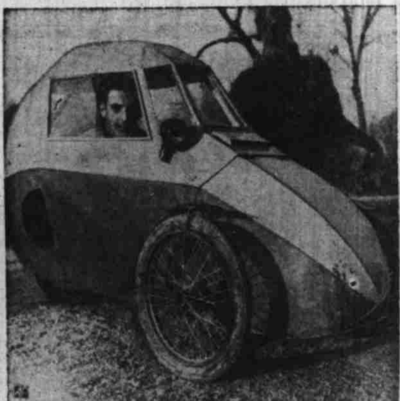
LICENSE-AND-TAX-FREE —Buyers of this 27-mile-an-hour German auto, built in Upper Bavaria and sold at 900 marks ($270) don't have to have a license or pay taxes on it.