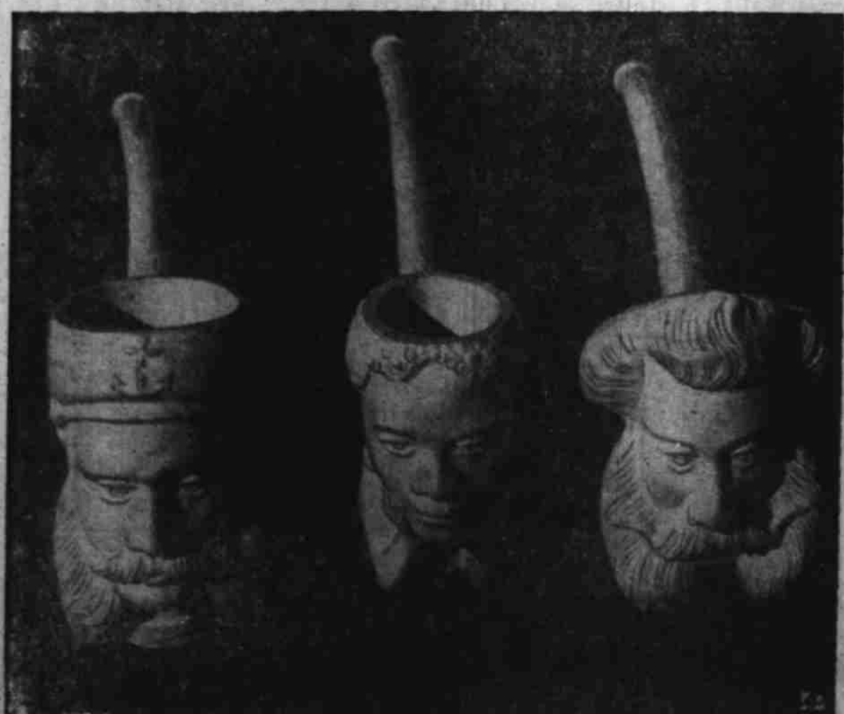
CLAY PIPES TO ORDER —Pipe bowls, holding heads of a ship captain, an African woman and Sir Walter Raleigh, are produced by the Goedewagen plant in Gouda, Holland. Some bowls, made by a secret process, conceal a picture in the clay which becomes visible after use.