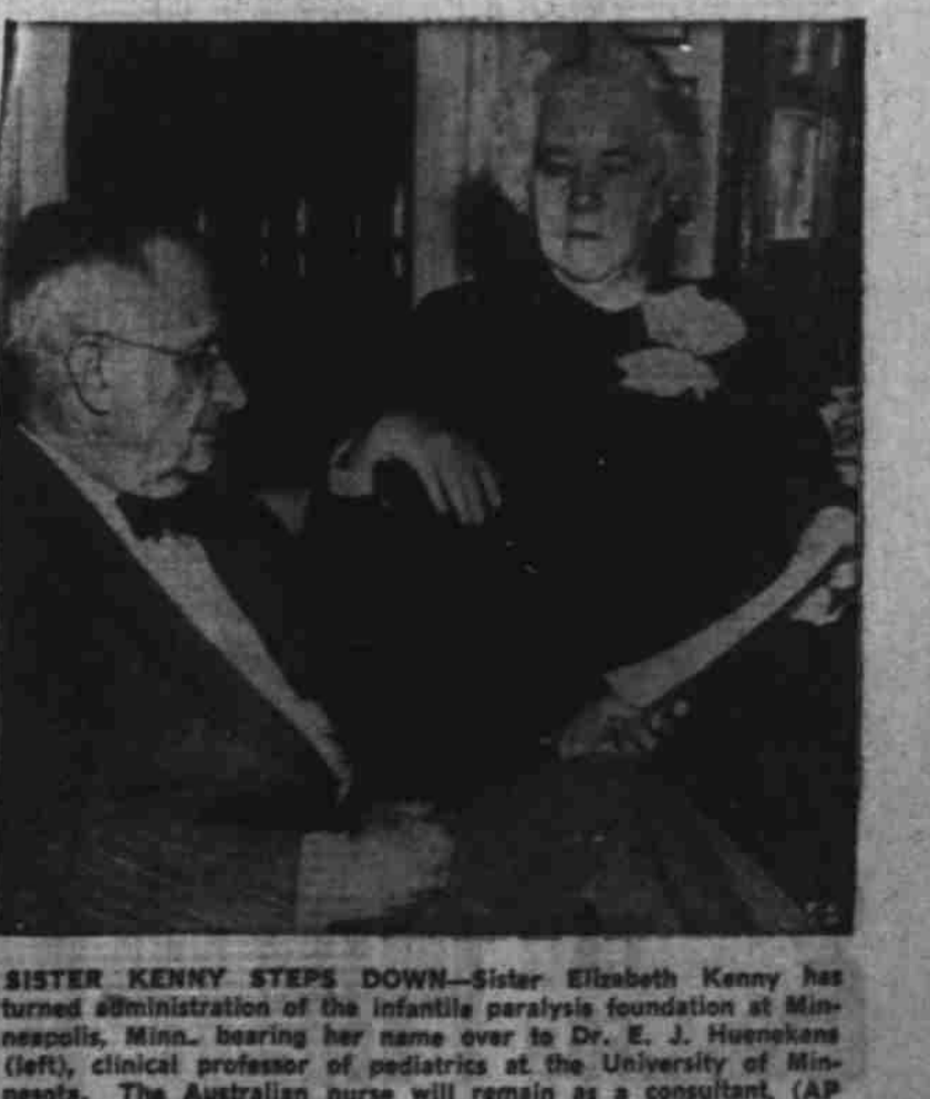
SISTER KENNY STEPS DOWN—Sister Elizabeth Kenny has turned administration of the infantile paralysis foundation...