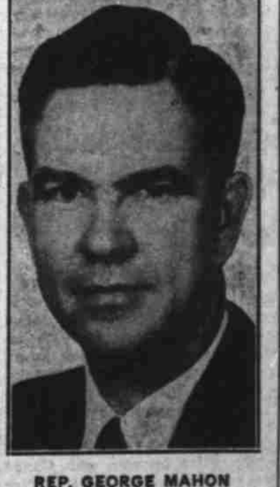
REP. GEORGE MAHON