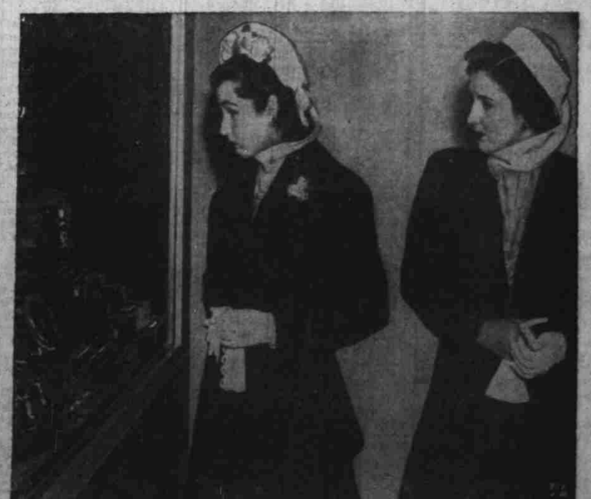
LOYALTY GOES TO THE FAIR —Princesses Fawzia (left) and Faiza (right), sisters of King Farouk of Egypt, inspect a jewelry exhibit at a miniature "World's Fair" in Cairo. Two hundred acres are devoted to Egypt's progress in industry, science, agriculture and welfare.