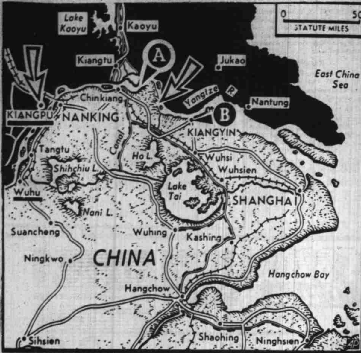
FIGHTING EXPLODES IN CHINA—Communist attacks along the Yangtze River...