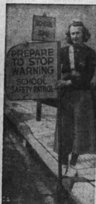
SUPER PATROL —Betty Mosher, 13, warns heavy traffic a block before the school crossing at Menlo Park, Calif.