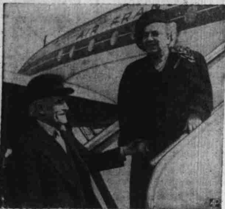
MAESTRO HOLDS HANDS —Arturo Toscanini, conductor, holds his wife's hand at the New York International Airport where she boarded a plane for Paris, en route to Italy.