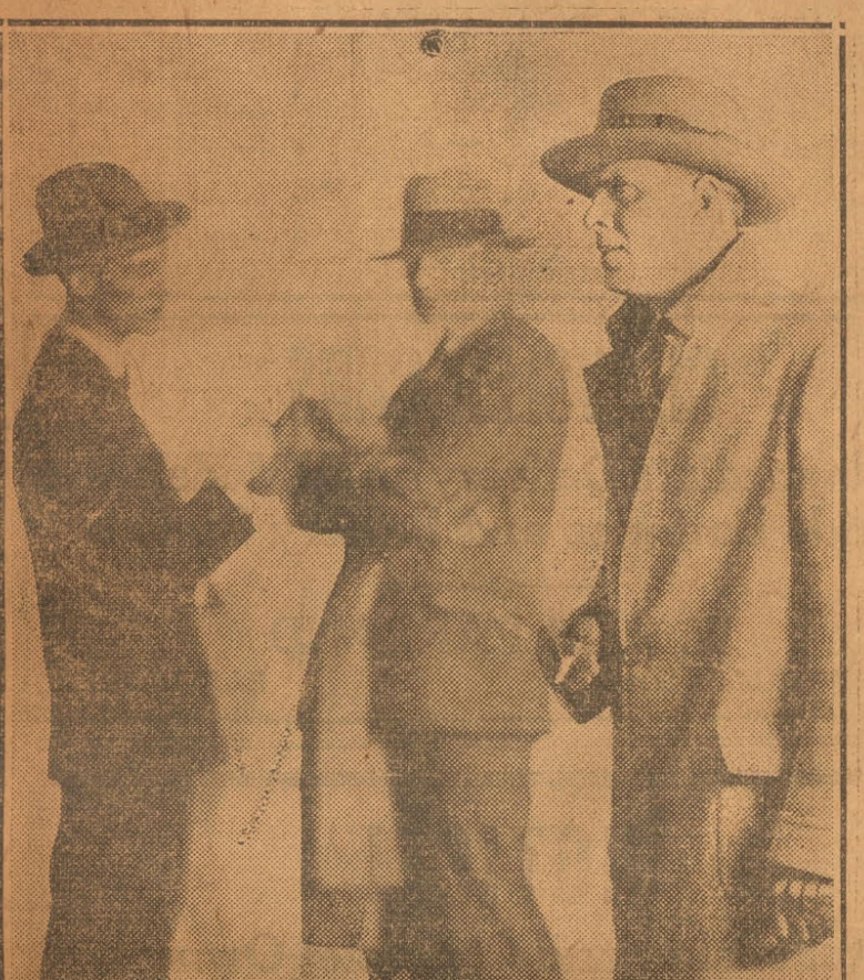
He encountered stares and heard whispers.

(The names and situations in this sire to break out into wild, crazy and wrote a long letter to Fay Milbury are fictitious.) With it however was coupled the laughter. With it, however, was coupled the With the thing locke pretty to finish it. (To Be Continued)