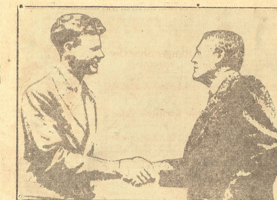
When "Slim" Lindbergh swooped down to Le Bourget field in Paris after crossing the Atlantic, one of the most enthusiastic of the cheering crowd that surged around him was Ambassador Myron T. Herrick (right), who is shown shaking hands with the American flyer.

To Investigate Complaints Of Bad Treatment