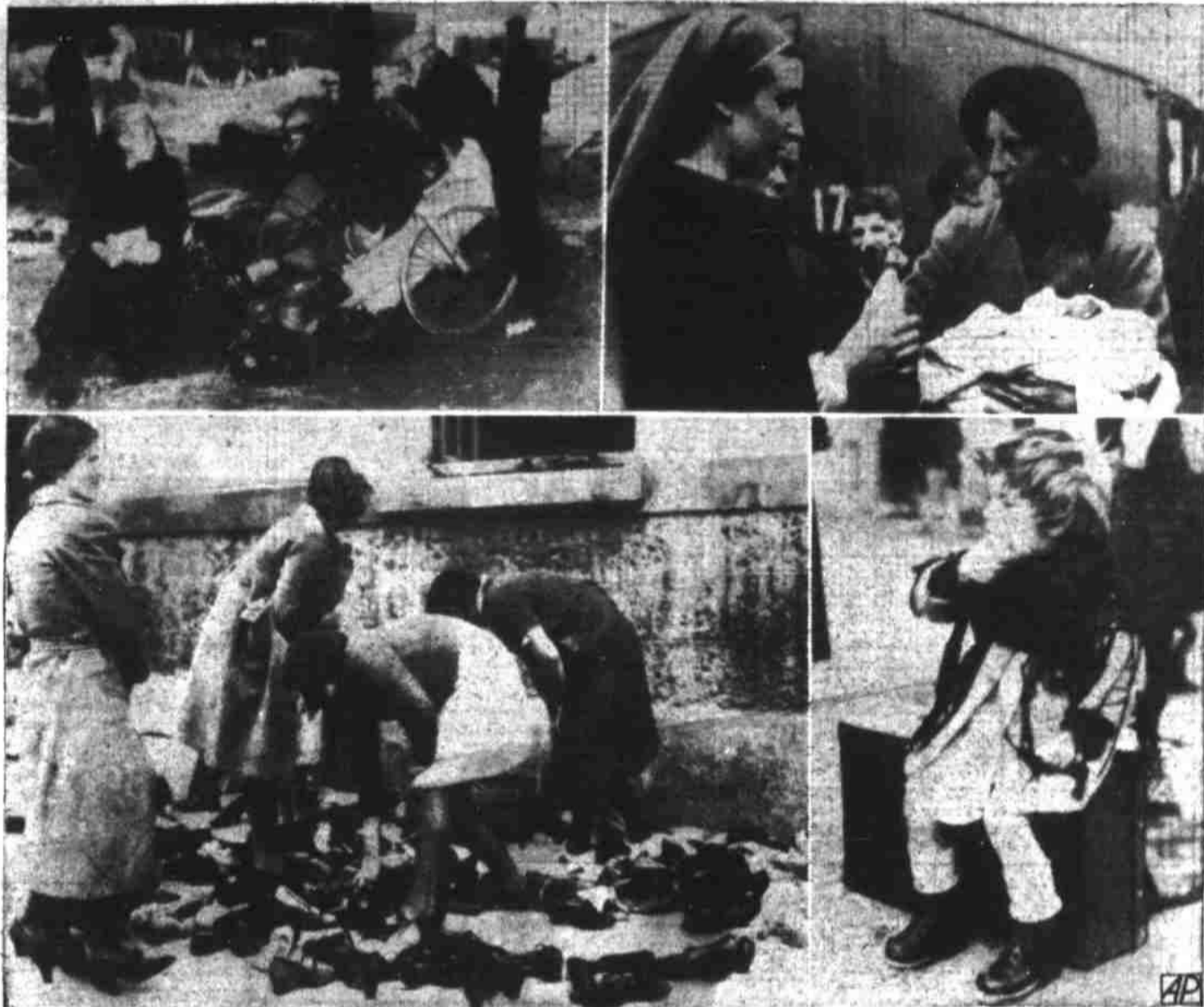
THESE NEED RED CROSS HELP—Here's the 'other army' of the war, people impoverished by the savage conflict, people in need of help which the Red Cross refugee fund would provide. Driven from their homes by advancing Nazi armies, an aged French couple (top, left), guards the only possessions they were able to salvage—all they had left to show for a lifetime of toil. At the right (top), a nurse provides milk for a hungry baby held by its mother. Lower left: shoes for road-wearied refugees at a French welfare center. Lower right: strange interlude in a child's life; a French youngster occupied with the serious business of eating.