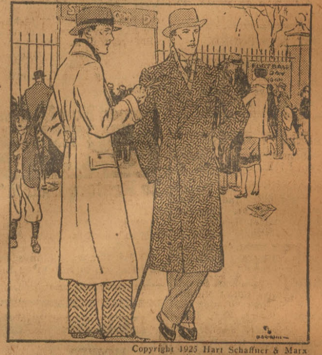
Copyright 1925 Hart Schaffner & Marx

AND THEY KNOW THE FINE QUALITY OF THE MERCHANDISE WE CARRY IN STOCK—OUR BUSINESS HAS BEEN BUILT ON NATIONALLY KNOWN, ADVERTISED BRANDS AND GOOD SERVICE PLUS SERVICEABLE PRICES, AND DURING THIS GREAT SALE WE ARE GOING TO SELL YOU THE FINEST OF MEN'S WEARING APPAREL AT PRICE REDUCTIONS THAT WILL MAKE YOU COME HERE AGAIN AND AGAIN.