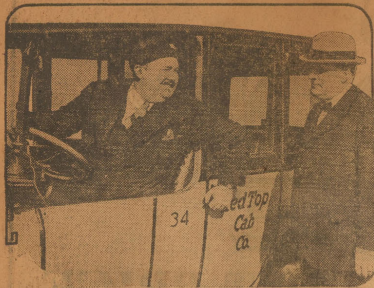
Paul Whiteman, famous jazz band leader, dipped back into the years while visiting Des Moines, Ia. Before becoming a musician he drove a taxi; and this photo shows him sitting in the driver's seat of a Des Moines cab. With him is Gov. John Hammill of Iowa, whose guest Whiteman was.