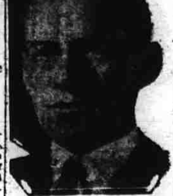
Senator Edward E. Tydings of Maryland introduced a resolution authorizing the President to claim for the United States lands in the Antarctic discovered by Americans.