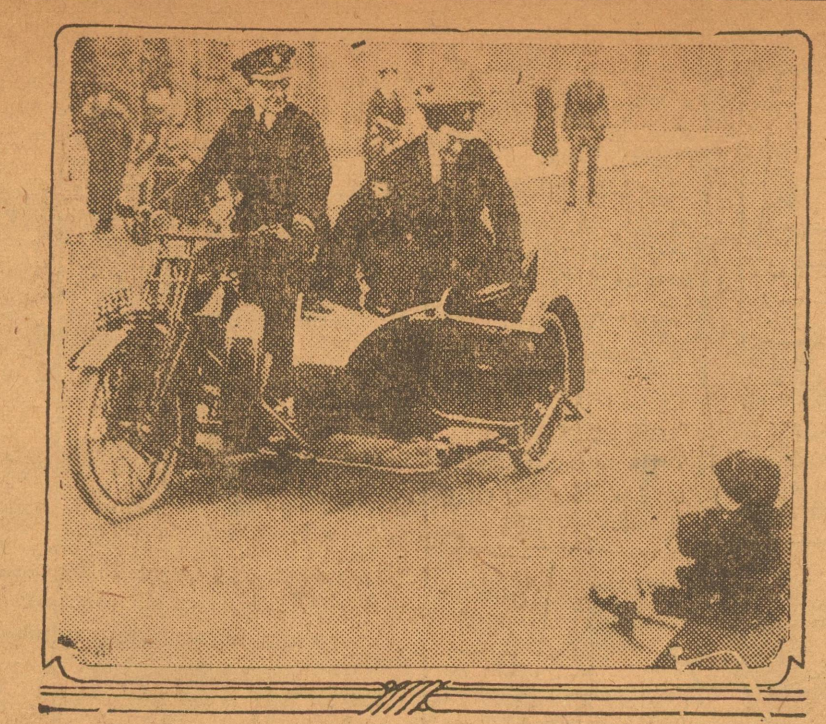
Typical English motorcycle policewomen on London street. The work of the women police of London has been so successful that the corps has been equipped with motorcycles and sidecars to enable them to do greater work. The women operate the machines themselves and do all kinds of police work.

mighty son and inspiring in him the membership in any denomination. It is not enough that you favor the sympathy with the suffering and love To her bright spirit this bit of in-